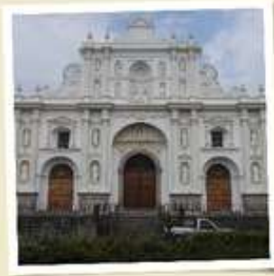
(53) Mayan sales-girl (54) unique Trinity mural at Antigua church (55) guard dogs at border crossing (56) Hotel Posada San Pedro, Antigua (57) hotel courtyard (58) Cathedral of San Jose