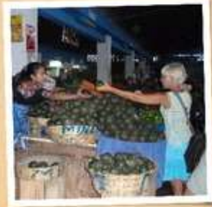
(59) Parque central, Antigua (60) Arch of Santa Catalina (61) Mayan sales-lady (62) marketplace (63) special fruit (64) buying avocados