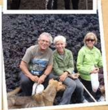
(77) Pacaya volcano model (78) trail to volcano (79) view of volcano (80) river of lava (81) roasting a marshmallow (82) lunch break