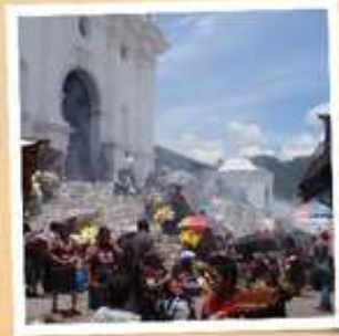
(107) boat ride to mangroves (108) "triple-sunrise" (109) return to boat launch (110) procession at Chichicastenango (111) famous market-place (112) Santo Tomas church