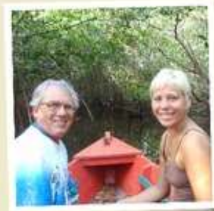
(101) bungalow at resort, Monterrico (102) pool-ocean (103) walk on black (volcanic) sand (104) Monterrico town (105) sea turtle hatchery (106) boat ride thru mangrove