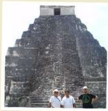
(19) Temple 1 is known as the "men's temple" (20) with a Mayan in costume