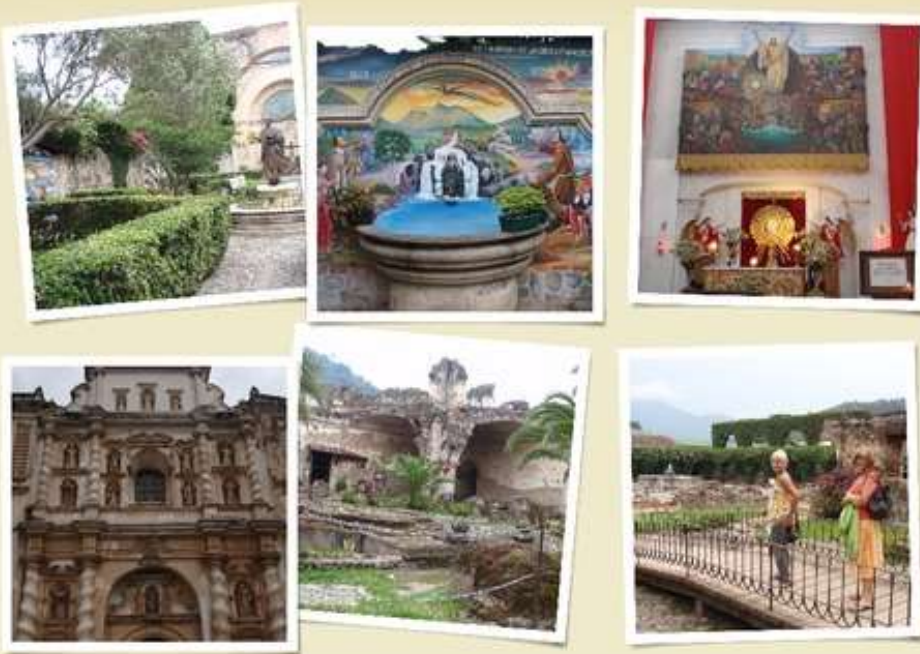
(89) garden of San Francisco church (90) mural of Saint Hermano Pedro (91) Mayan mural at altar (92) Church of San Francisco (93) ruins at church (94) Casa Santo Domingo, colonial-era convent