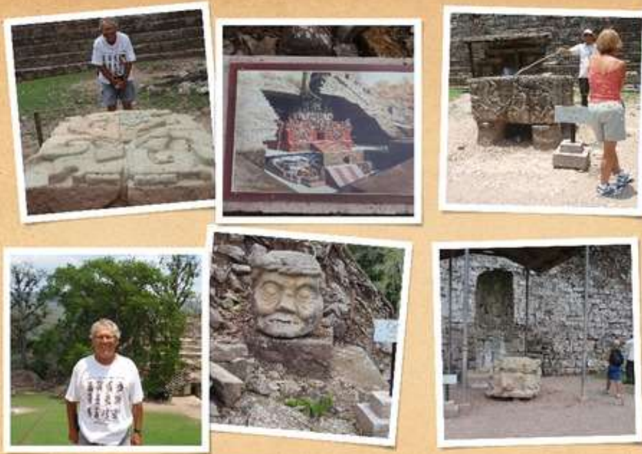
(37) Copan archaeological site (altar stone) (38) Rosalila temple (under Ceiba tree) (39) Altar Q - dynasty of kings (40) Mayan gods shirt (41) Cabeza (42) Estela N - represents Smoke Shell, builder of stairway