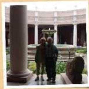
(119) boating on Lake Atitlan (120) Solar corona (121) museum in Guatemala City (122) model of Tikal (123) diorama (124) courtyard