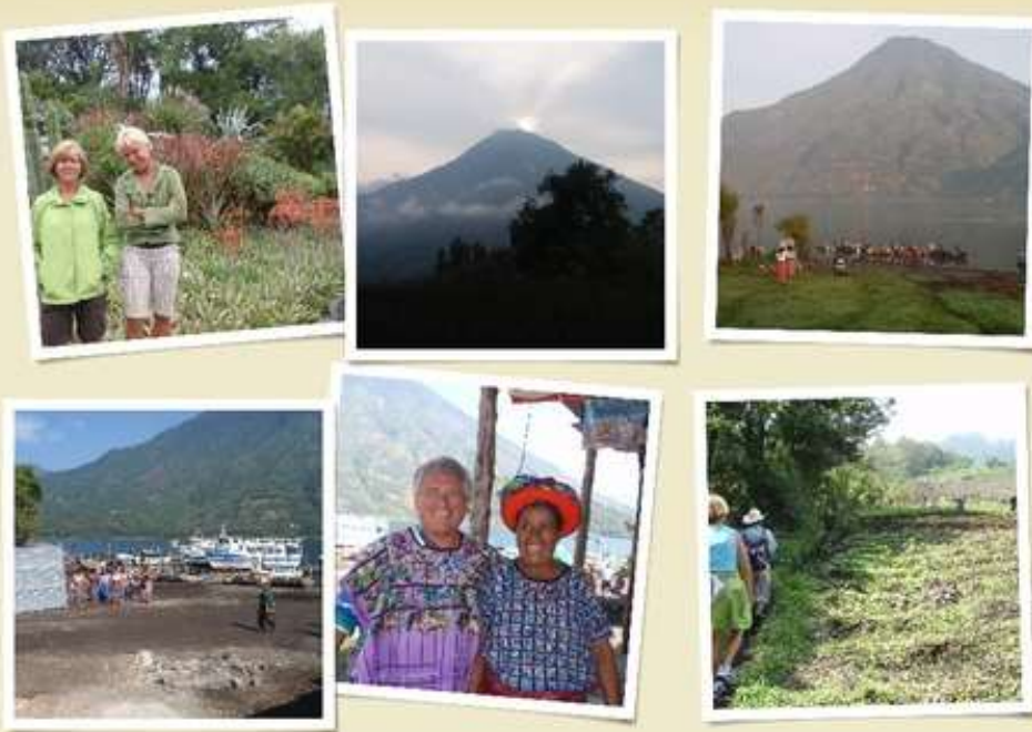
(83) Hotel Bambu, Santiago (84) sunset over volcano San Pedro (85) laundromat on lake (86) boat launch (87) Quiche Mayan saleslady (88) trail to Pacific view