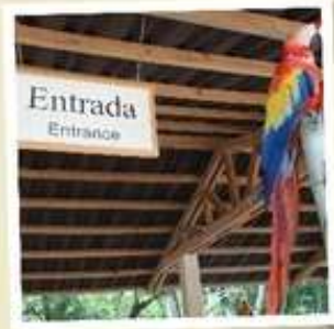
(43) with Smoke Shell (44) two-headed turtle (45) tunnel to Rosalila temple (46) heiroglyph stairway (47) ball-court (48) sacred macaw