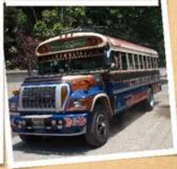
(95) Maximon (local "saint") (96) morning laundry (97) Agua volcano, Antigua (98) guide Miguel (99) restaurant at ruins (100) chicken bus