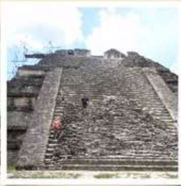
(17) sacred Ceiba tree (18) climbing temple steps