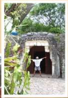
(49) Museum - replica of Rosalila temple (50) temple facade (51) side view of temple (52) entrance to museum through snake jaws