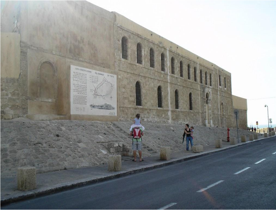
Jaffa fortification. End of 19th century Ottoman walls.