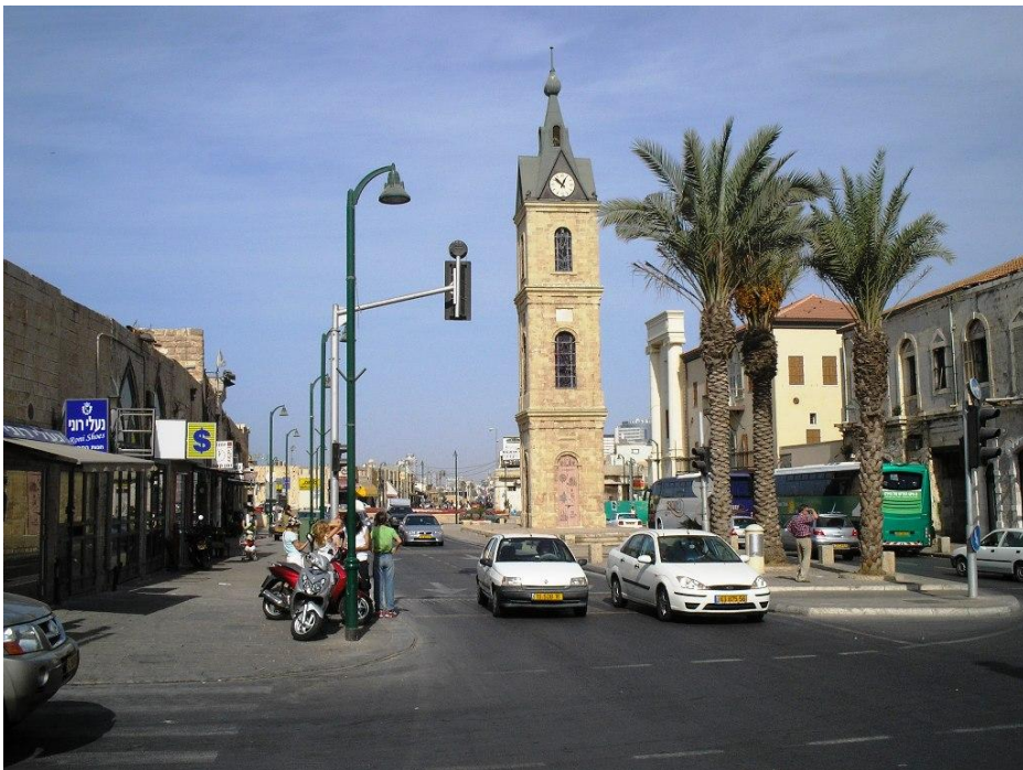
Clock Tower in modern Jaffa -- Built in 1901 to mark the 25th anniversary of the Turkish sultan.