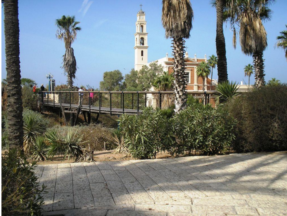
The Wishing Bridge in HaPisga Garden -- The garden lies on top of the ancient 'tel' (mound) of Jaffa.