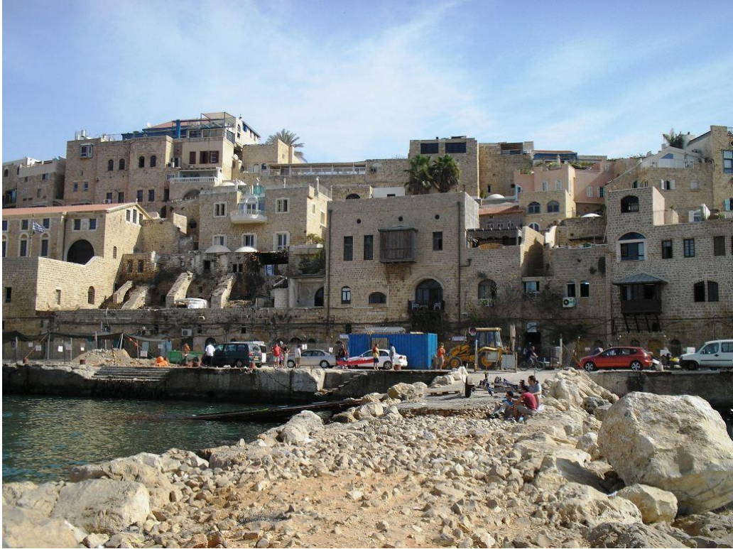
Old Jaffa, view from harbor