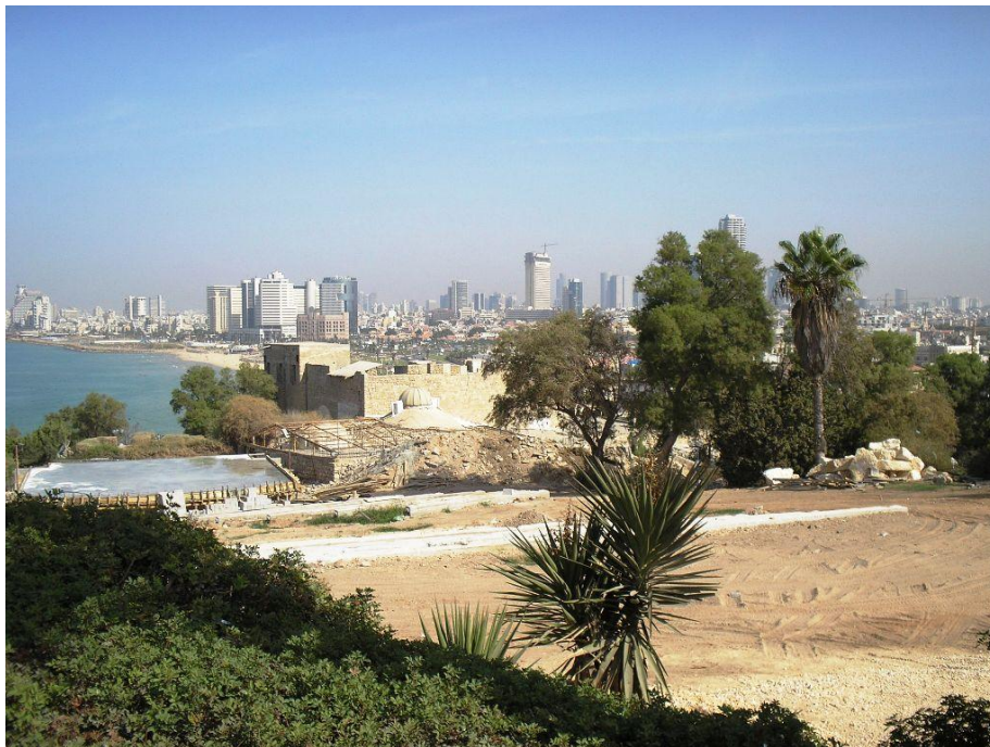
Panoramic View of Tel Aviv