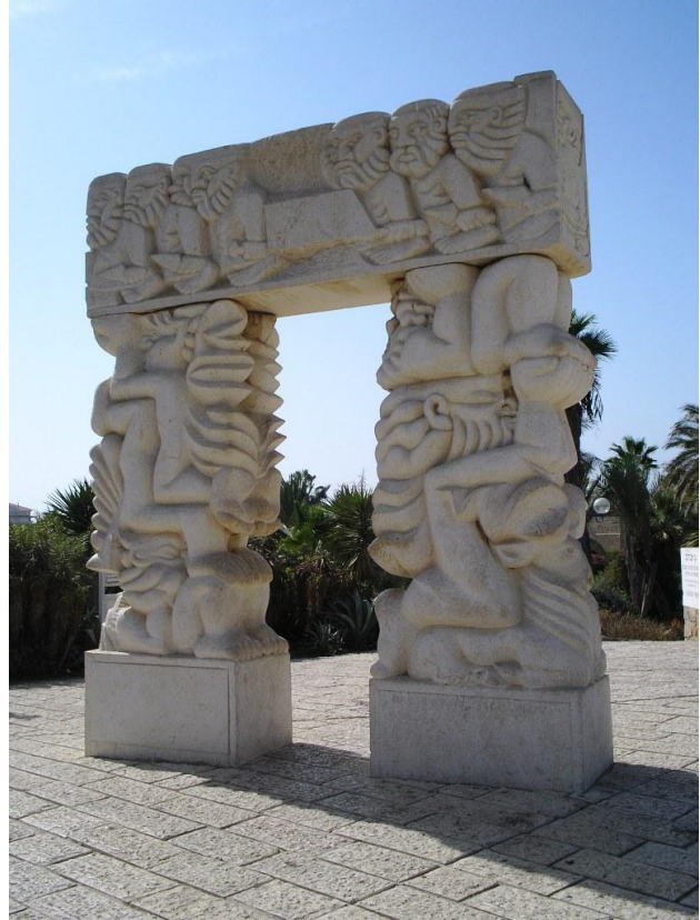
Other side of Statue of Faith