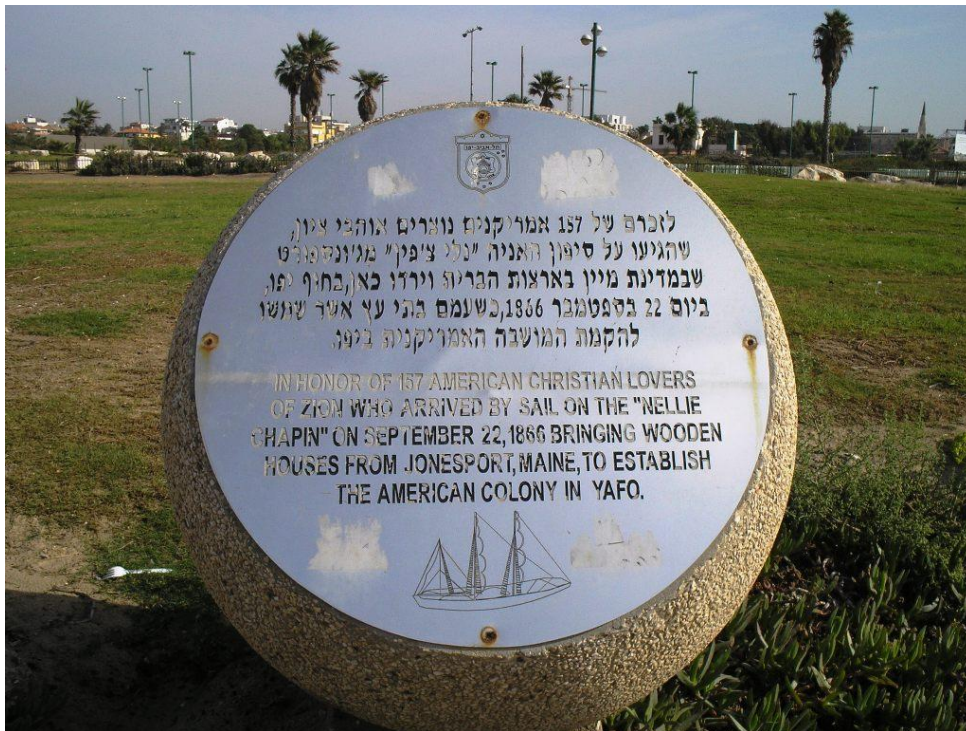
Memorial to American Christian Lovers of Zion -- Memorializes Americans who brought wooden houses in 1866 to establish a colony in Yafo (Jaffo).