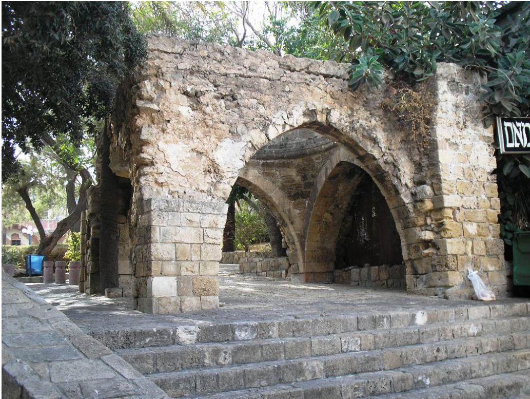
Archway entrance to the park.