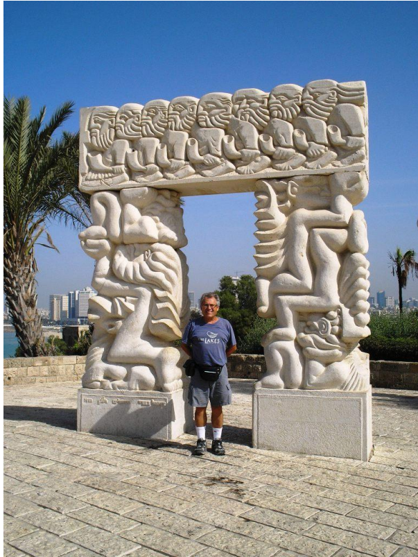
Statue of Faith--Top panel shows Fall of Jericho, left pillar shows Jacob's Dream of Ladder to Heaven, right pillar shows Sacrifice of Isaac.