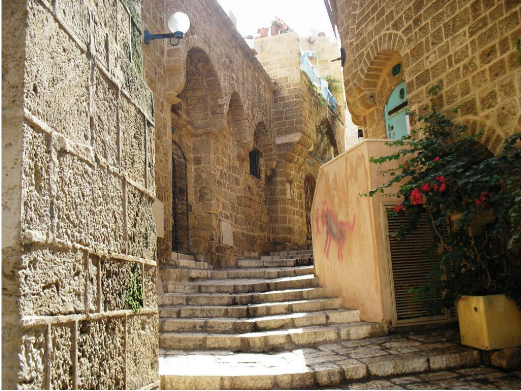
Steps up Old Jaffa street