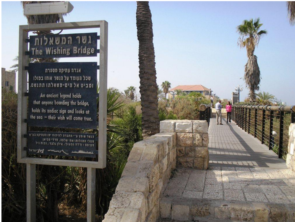
Ancient legend of the bridge -- An ancient legend holds that anyone boarding the bridge, holds its zodiac sign and looks at the sea - their wish will come true.