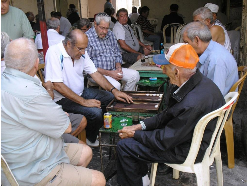
Men of Jaffa playing backgammon