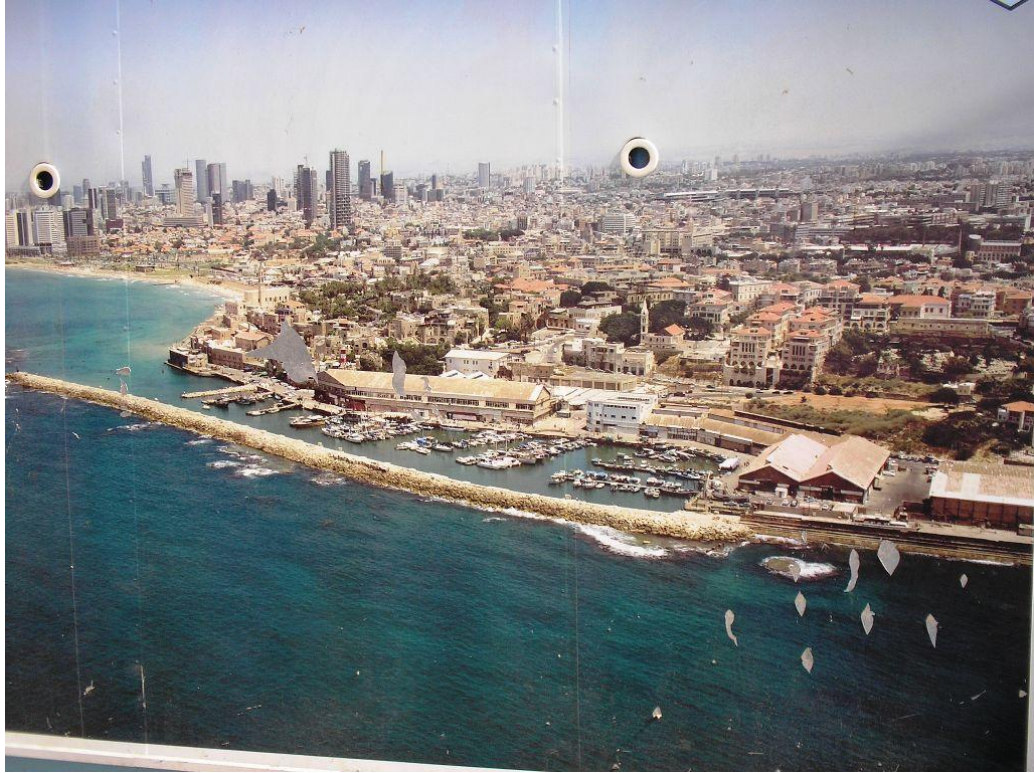
Mural of Port/City