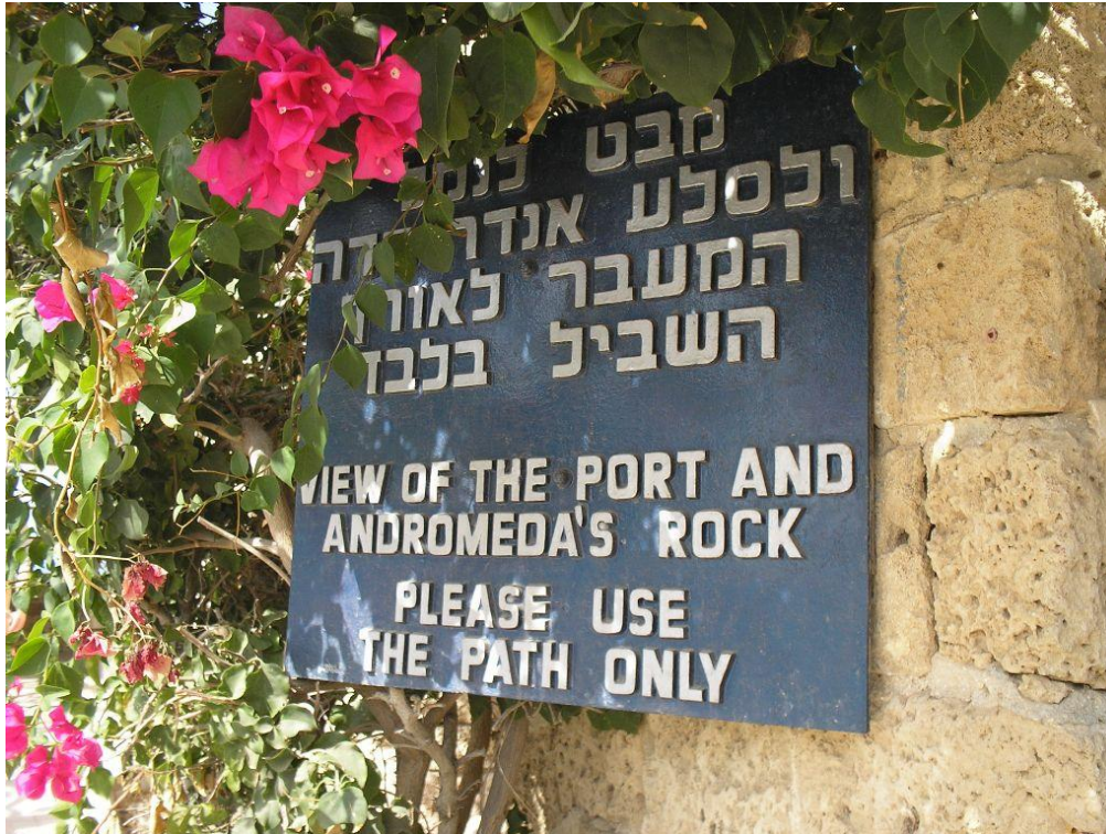
Sign - View of Port and Andromeda's Rock