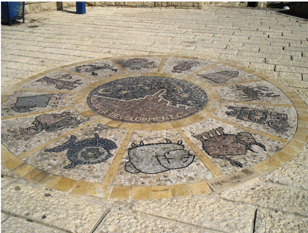
Zodiac tiles at the Wishing Bridge