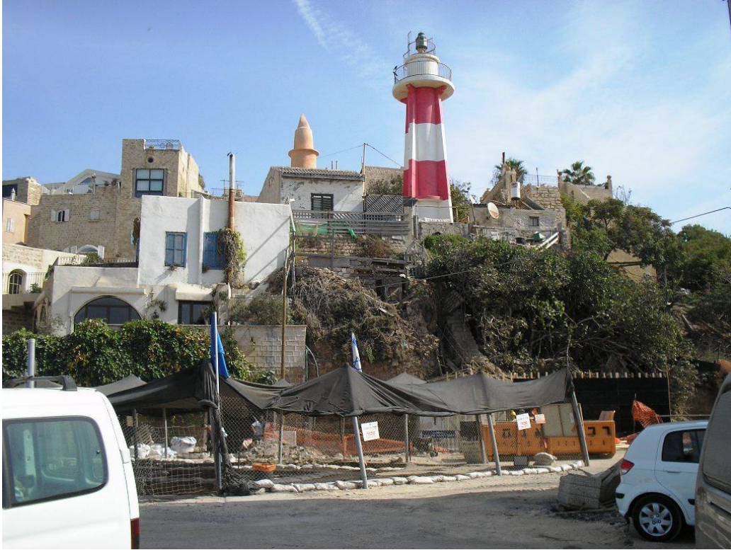
Lighthouse of Jaffa port.