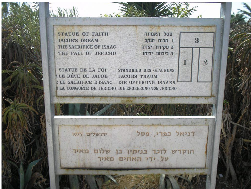
Statue of Faith - sign (explanation)