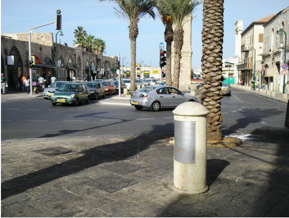
Marker on Clock Tower Square. Marker on street - to Jerusalem & Egypt -- Beth Eshel St. - way out to Jerusalem; Yefet St. - Gaza Road to Egypt. Marker is located at Clock Tower Square.