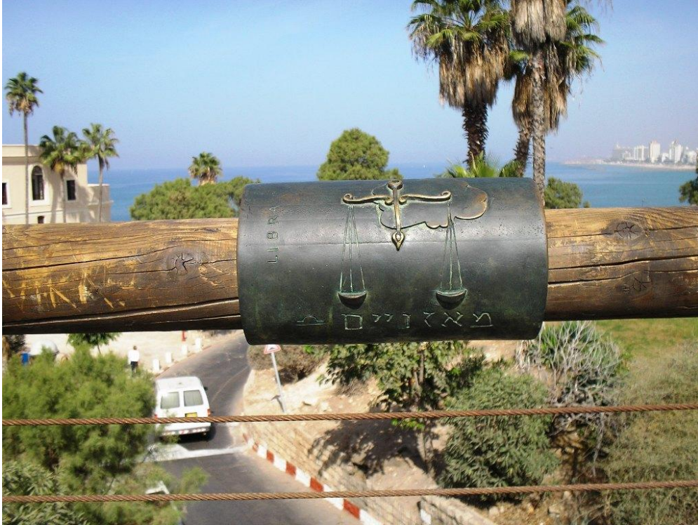
My zodiac sign - Libra, the Balance