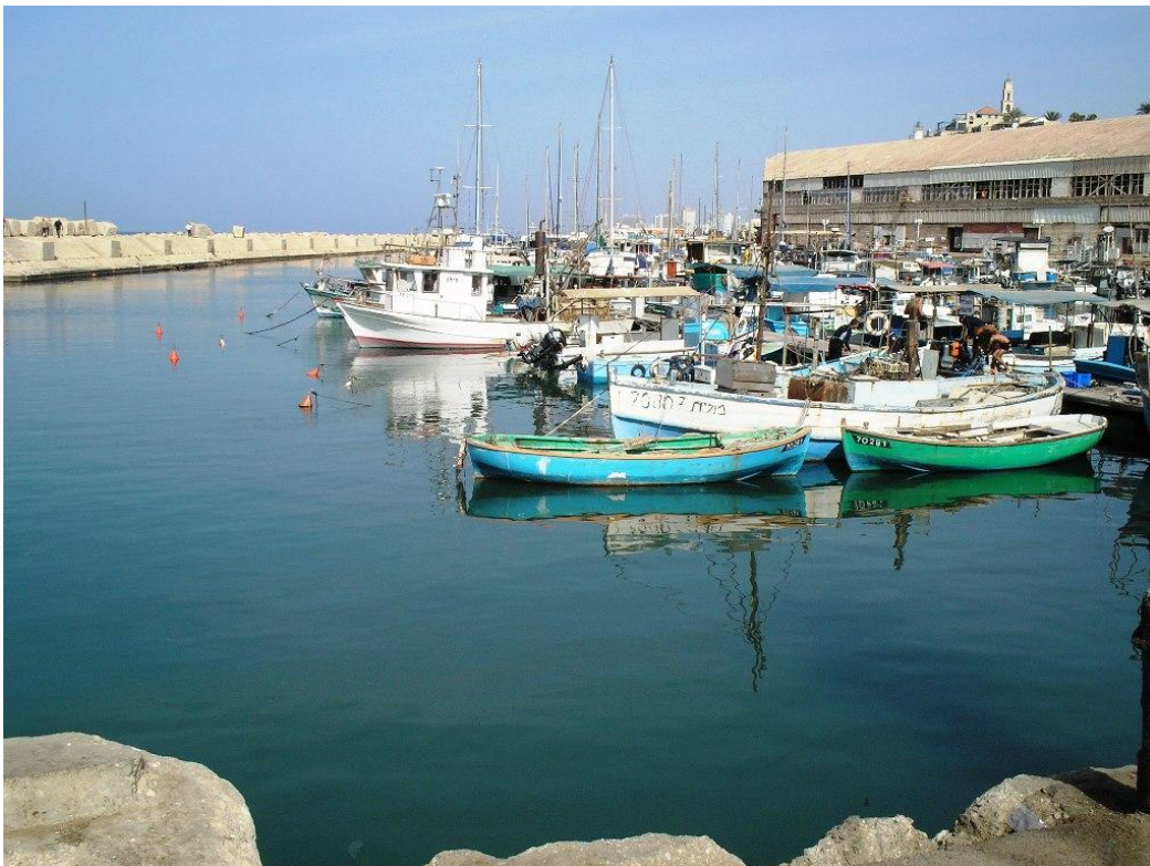
Jaffa Port (Marina) -- Restoration Project in progress.