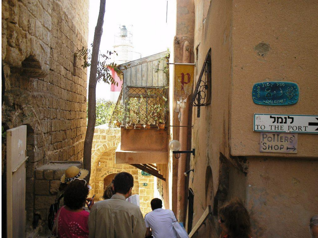
House of Simon the Tanner -- Peter the Apostle visited this house.