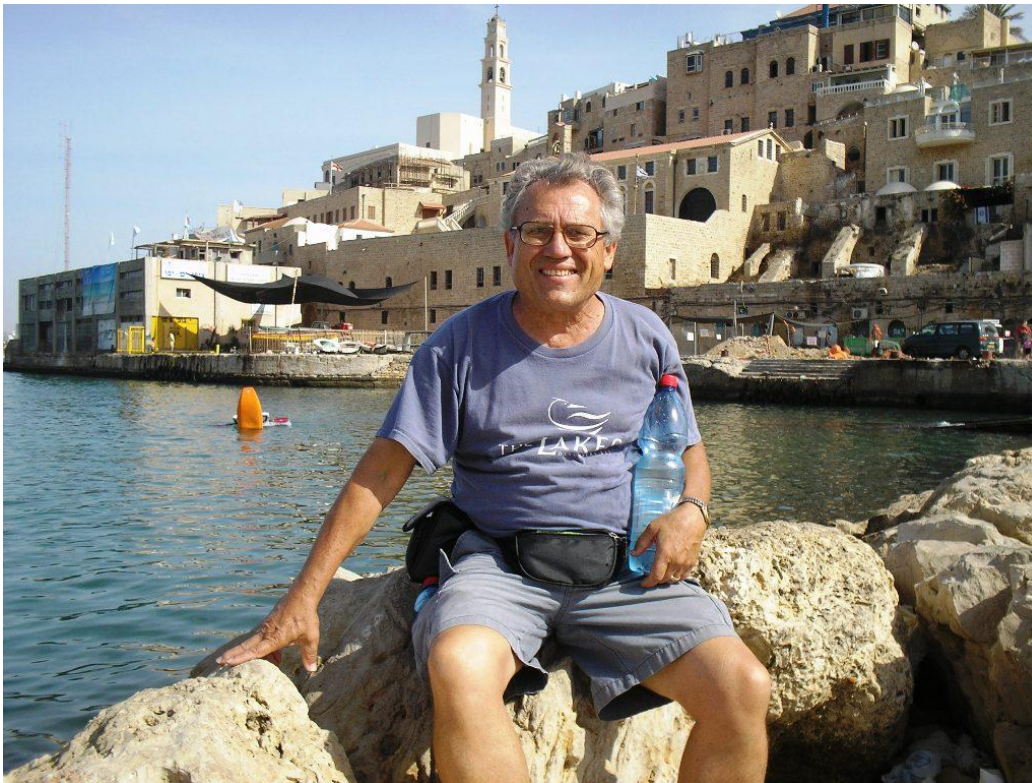
Me at Old Jaffa