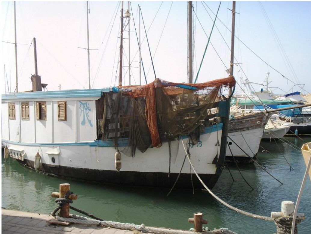
"Jonah's Boat" -- Fishing boats in the harbor.