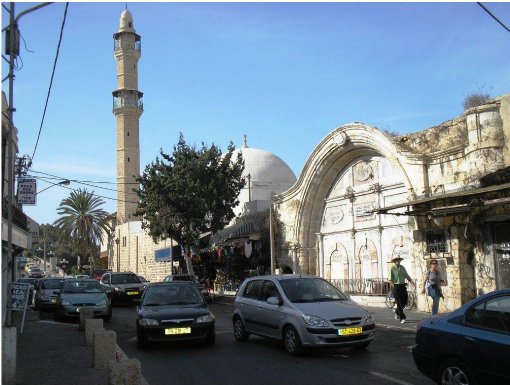
The Mahmoudiya Mosque. It dates from 1812 and remains in use by the Muslim community.