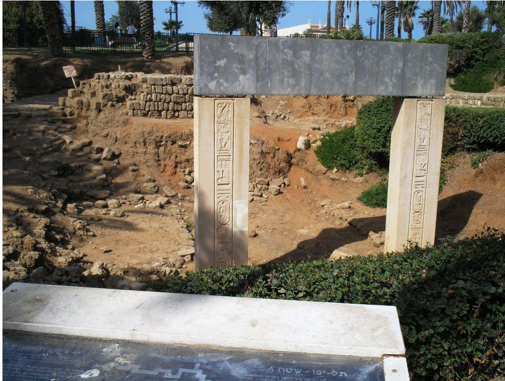
Ramses Gateway, Ramses II - Late Bronze Age, 1550 BCE. Excavation in 1955-1962