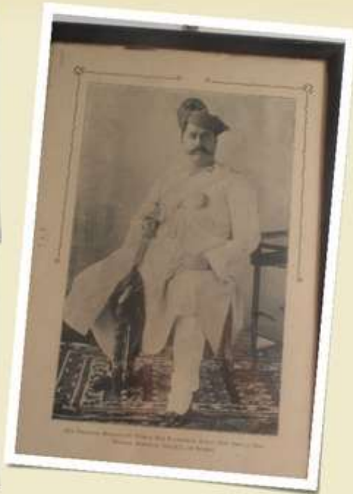
A photo of a former maharaja at Mahamaya Hotel, and the real maharaja of Balrampur; the maharaja's modern palace