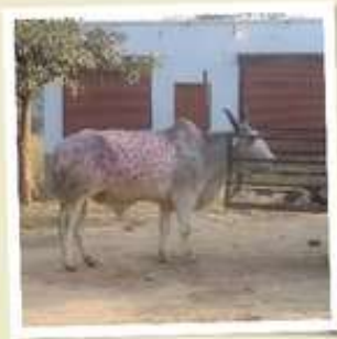
beggar children; at Mahamaya Hotel (palace) in Balrampur; painting of Mahamaya (Buddha's mother); celebrating Holi (spring festival of colors) at the hotel; "HAPPY HOLI"; HOLI-COW