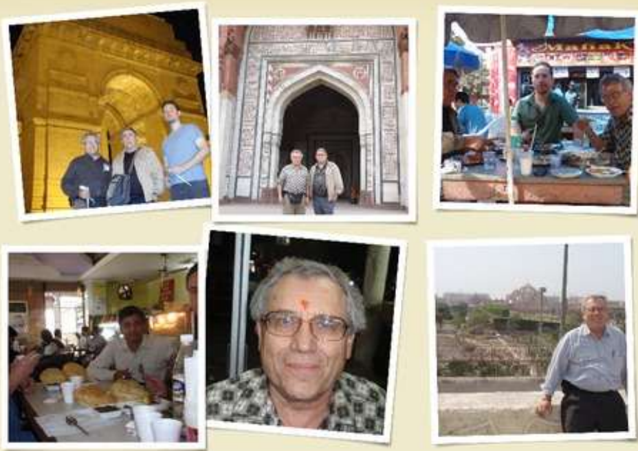
India Gate, Qala-i-Kuhna Masjid (mosque), eating at Dilli Haat, at a restaurant, "Tika" (3rd eye), Akshardham of Swami Narayan