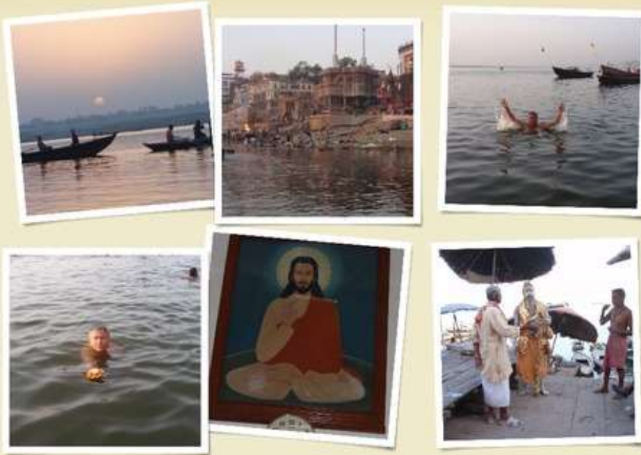
Sunrise on the Ganga (Ganges River); a cremation ceremony along the river; immersion in the river; flower and candlelight offering to the river; Christ the Yogi; Sadhu, a holy man at the river