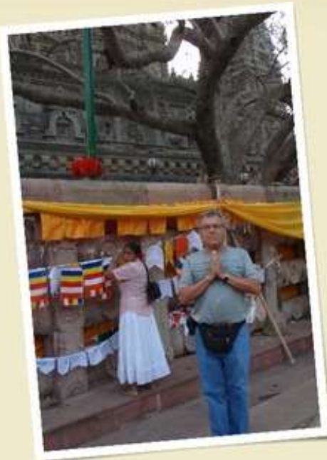
Entrance to the Mahabodhi Temple in Bodhi Gaya, "the most sacred place of Buddhist pilgrimage"; at the Bodhi tree, where the Buddha achieved the supreme