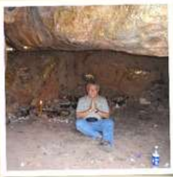
On top of "Vulture's Peak" (Griddhakuta Hill) in Rajgir, where the Buddha preached and meditated; Sign mentioning the Chinese pilgrim Hiuen Tsang (hero of "Journey to the West" -- the story that I taught in school); meditating in the cave where Buddha meditated