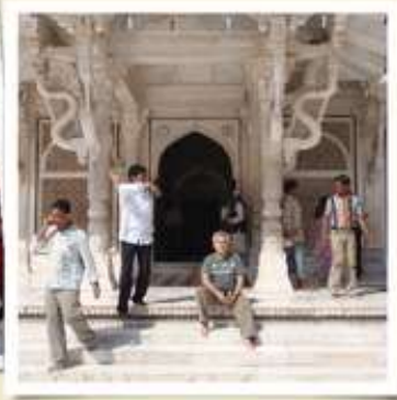
Shri Laxmi Narayan temple (made of white marble); temple dedicated to Sufi saint Salim Chishti at ancient capital Fatehpur Sikri