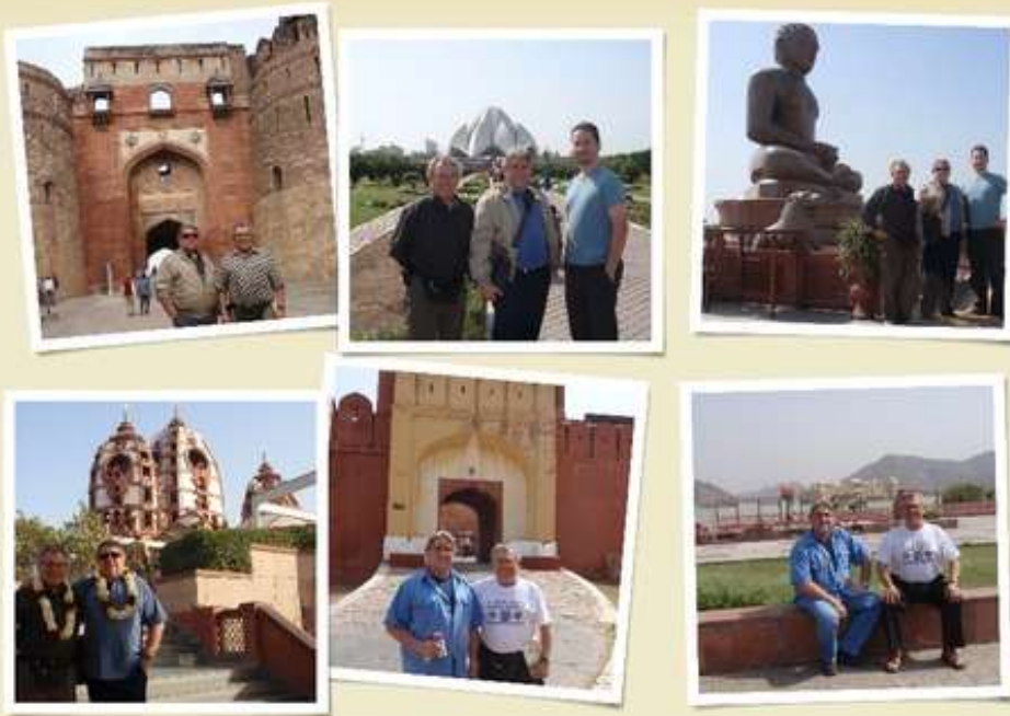
Purana Qila Archaeological complex and fort, Lotus (Bahai) Temple, Manavir statue (Jain shrine), Krishna Temple, Fort Jaigarh near Jaipur, Wind Palace near Jaipur