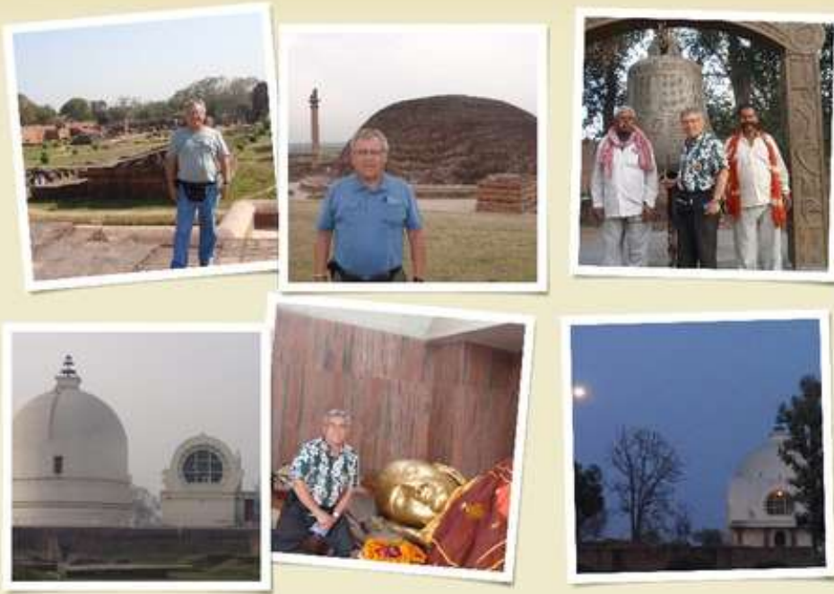
Nalanda University, where Buddha discoursed on the Four Noble Truths; excavated remains of Kolhua (ancient Vaishali); Dharma bell; MahaParanirvan, the stupa and temple of Buddha's passing; the Reclining Buddha; moonset at