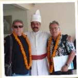
Birthplace of Krishna in Mathura, and painting of Krishna; Agra Fort on west bank of the Yamuna River (built by Emperor Akbar); train ride from Agra to Varanasi; first view of Ganges River & Varanasi; welcome to Varanasi