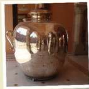
Jama Masjid (Grand Mosque); view of New Delhi from minaret; Mahatma Gandhi's Rajghat; Gandhi, the weaver; inside Amber Fort; Silver Jar (Gangajali)