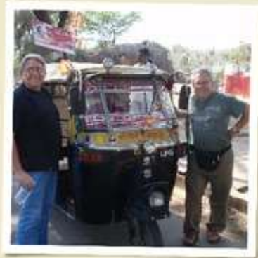
riding in a Tuk Tuk - Indian taxi; monkey on my back