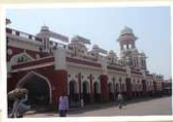
The Registry at Lucknow (where the War for Independence started in 1857); ladies doing Chikan embroidery in Lucknow; train station at Lucknow