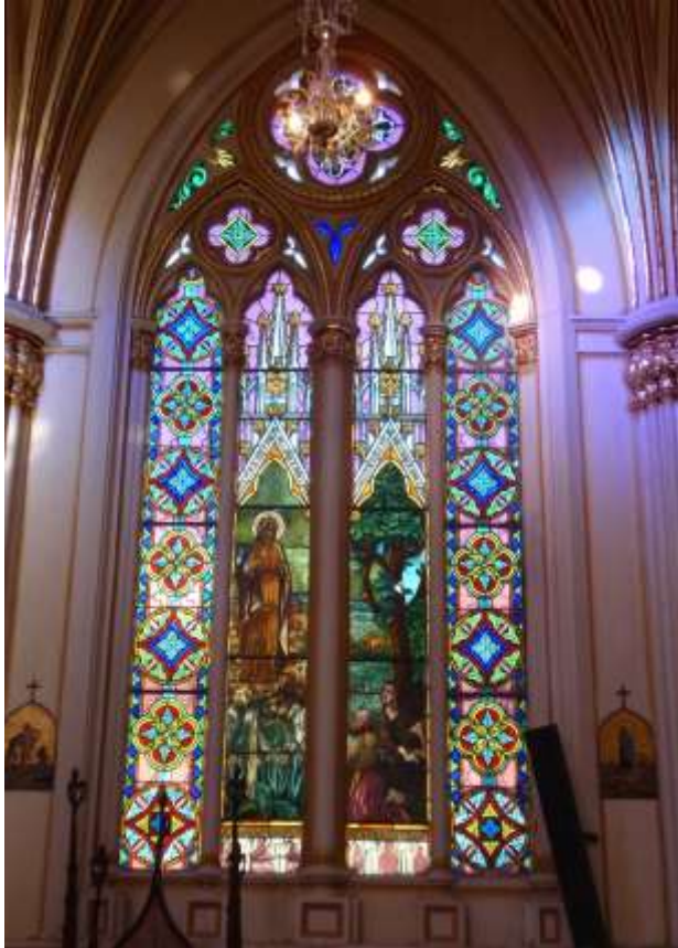
1 Notre Dame de la Salette