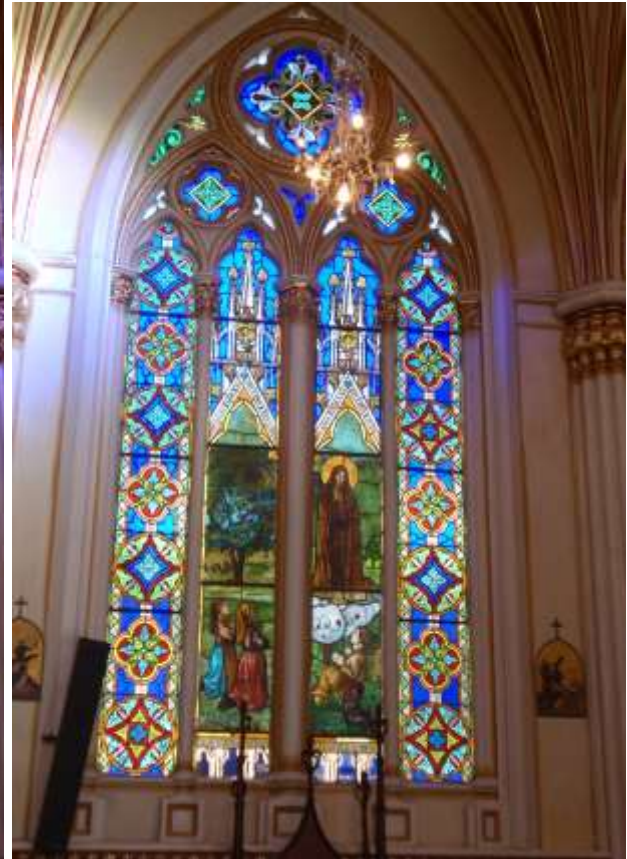
2. Lady of Fatima