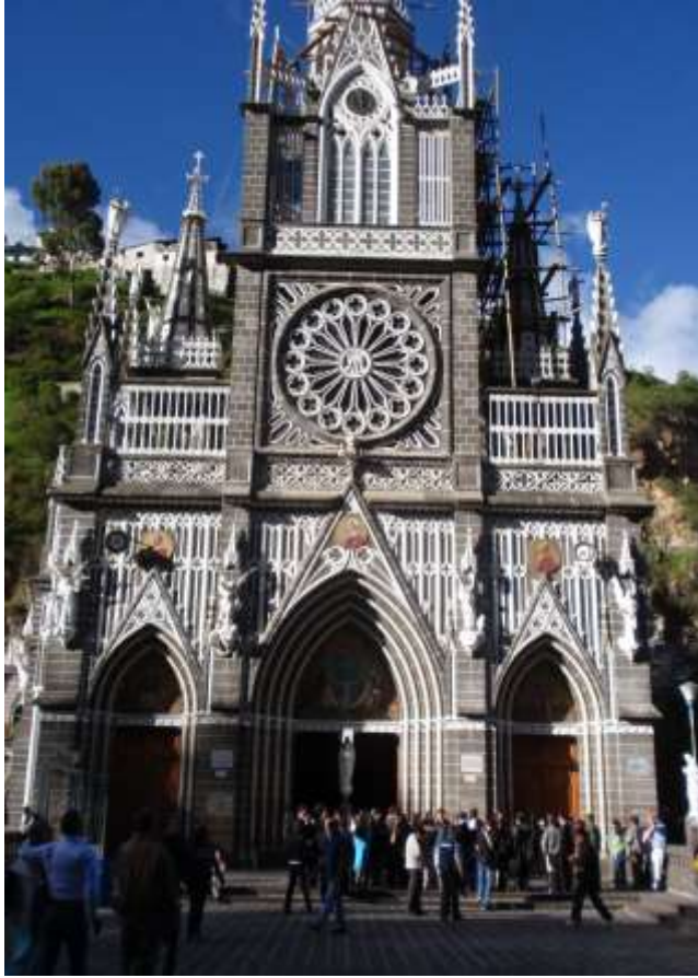
Front of Sanctuary