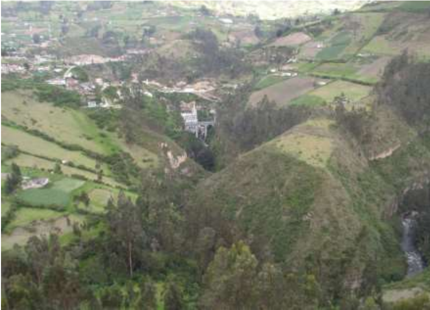
View of Sanctuary of Las Lajas, from border town Ipiales.