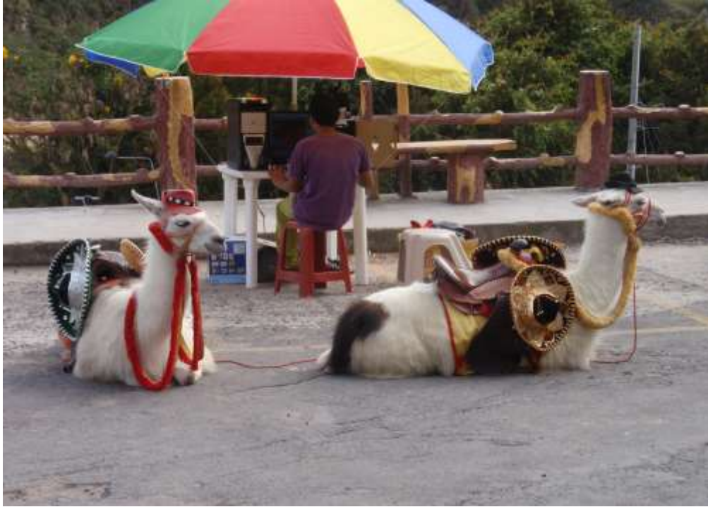
Llamas dressed up for picture-taking