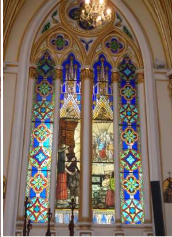
2. Nuestra Senora de Chiquinquirá