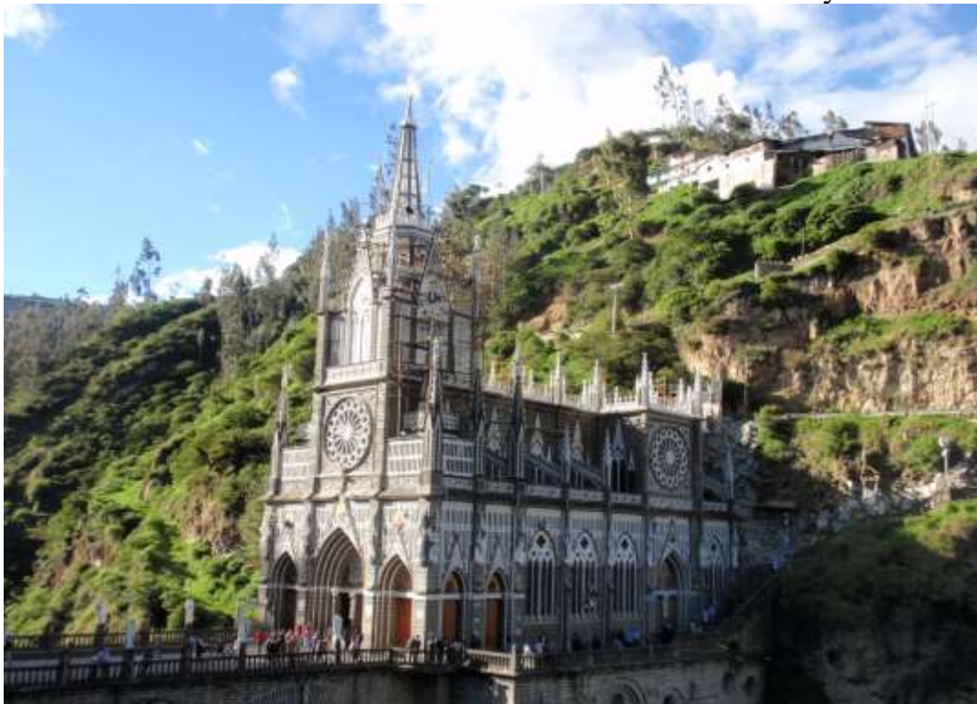
Side View of Sanctuary