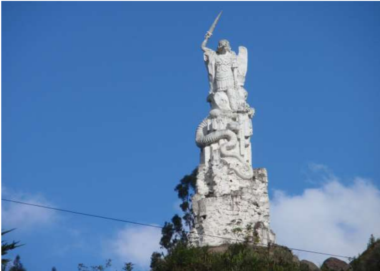
Archangel St. Michael, guardian of the sanctuary