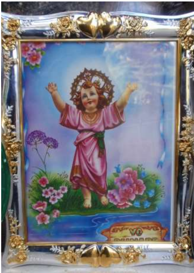
The Divine Child Wikipedia article on the Las Lajas Cathedral