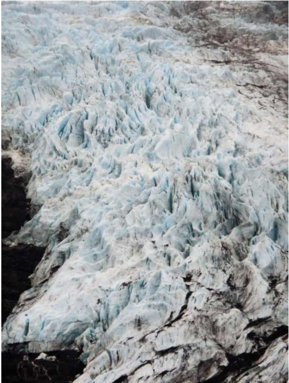
A view of the numerous crevasses on Wellesley Glacier.