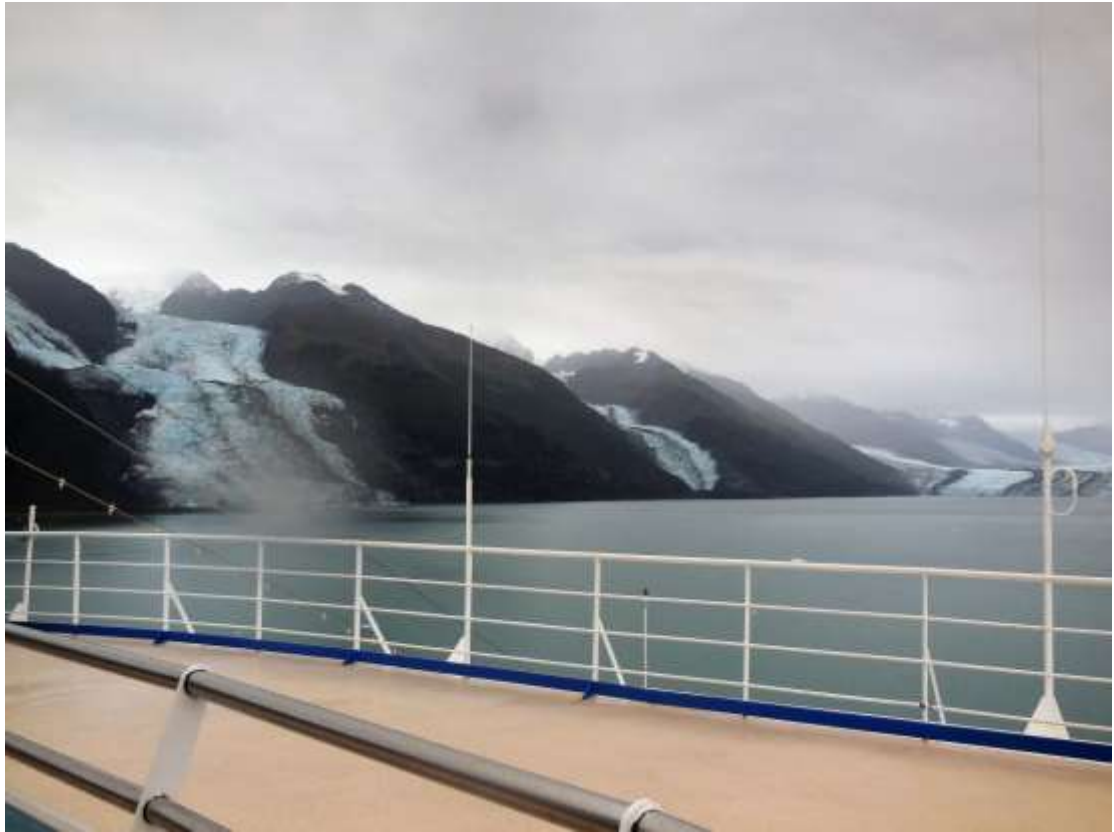
Bryn Mawr Glacier, Smith Glacier, and Harvard Glacier (L > R).