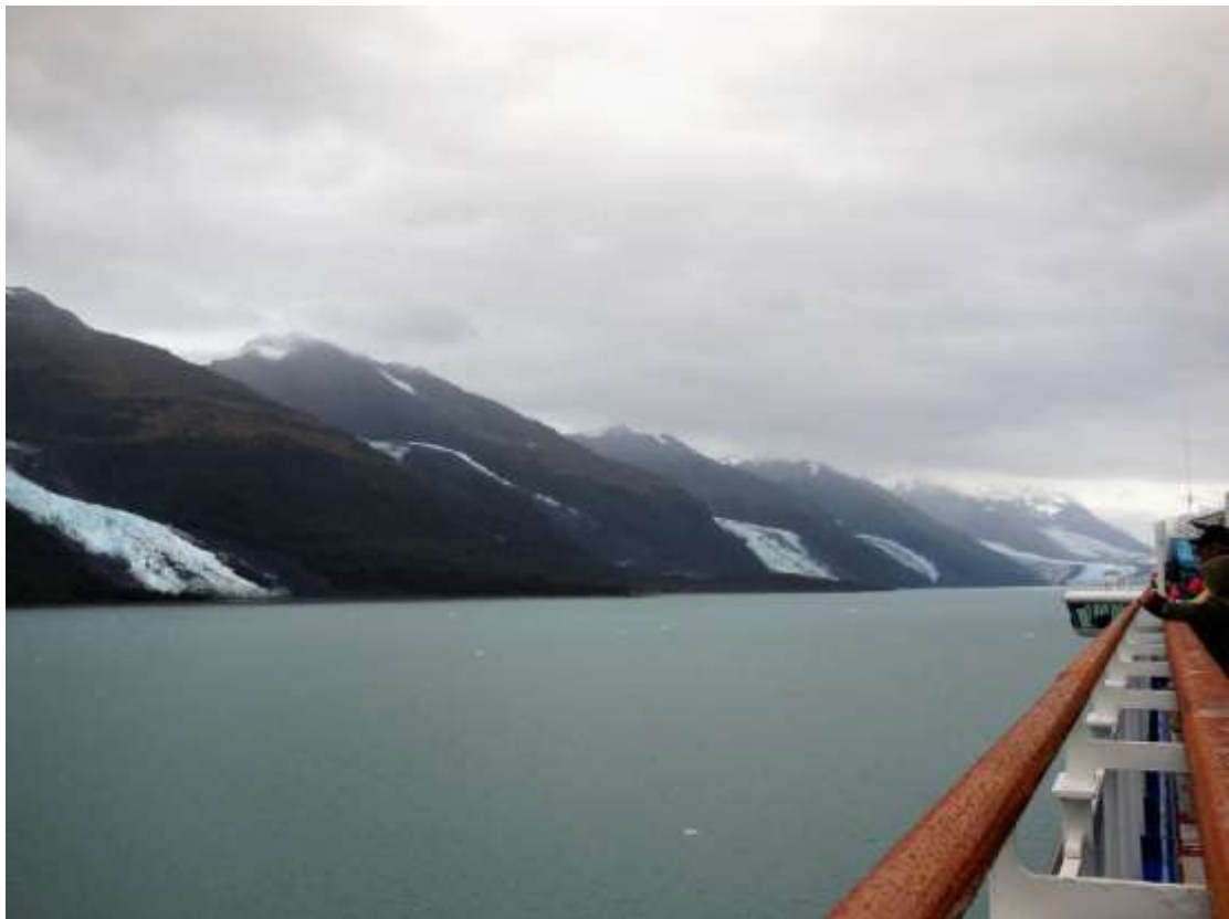
Glaciers (L->R): Wellesley, Vassar, Bryn Mawr, Smith, Harvard