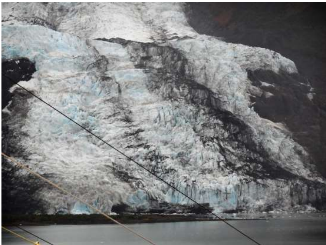
A Close-up of Bryn Mawr Glacier.