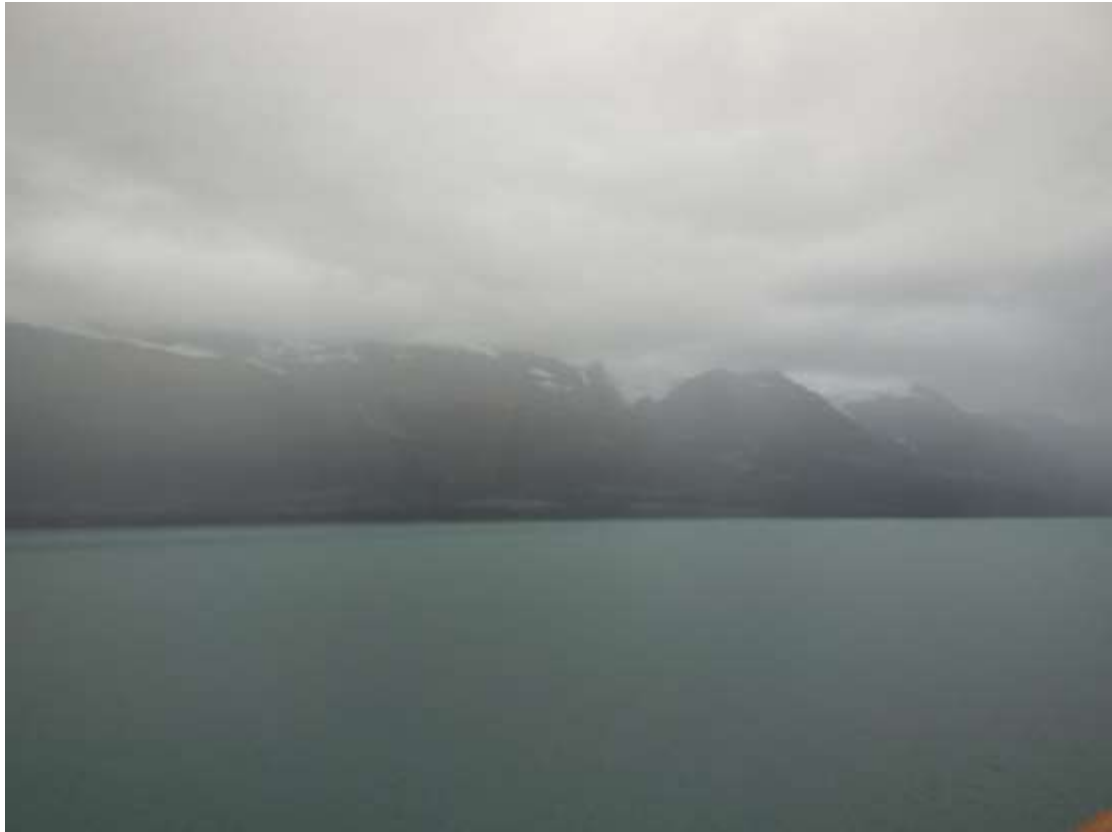
Entering College Fjord at 5:15pm. https://en.wikipedia.org/wiki/College_Fjord