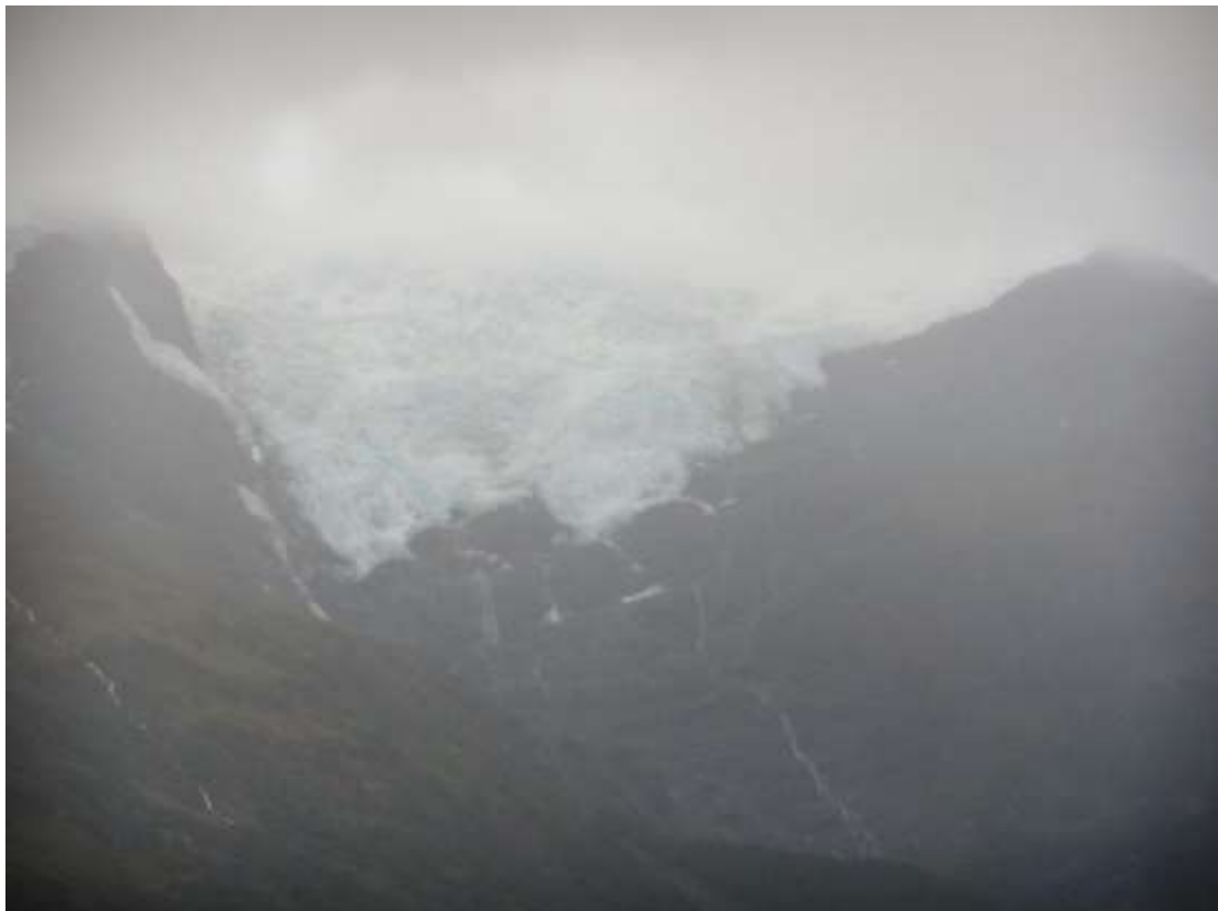
A large valley glacier (also known as a hanging glacier). Most likely Amherst Glacier.