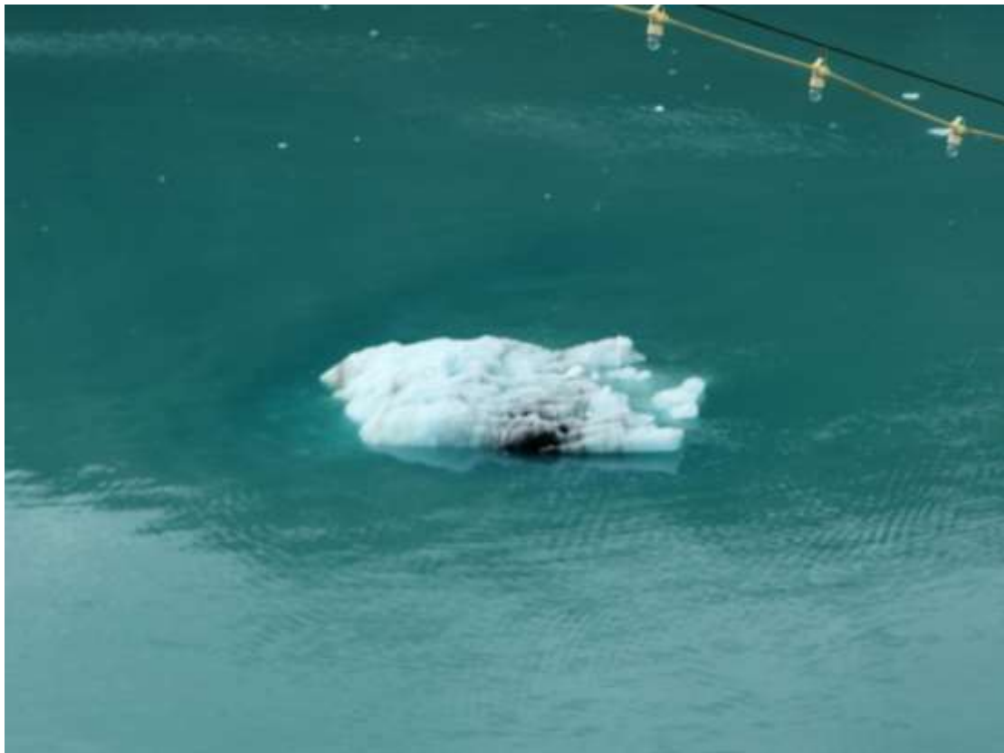
Icebergs floating on the water.