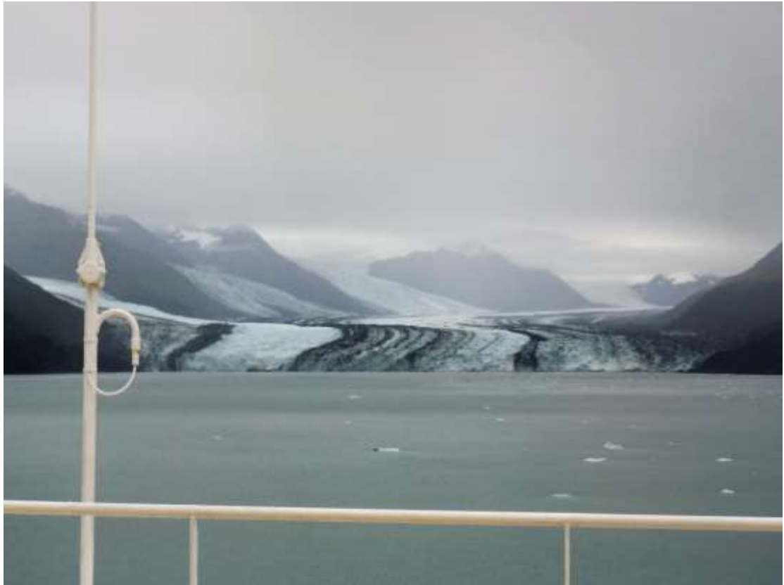
Another view of the famous Harvard Glacier.