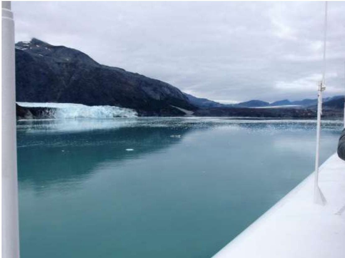
Vassar Glacier. Pieces of the glacier (i.e. icebergs) are floating on the water.