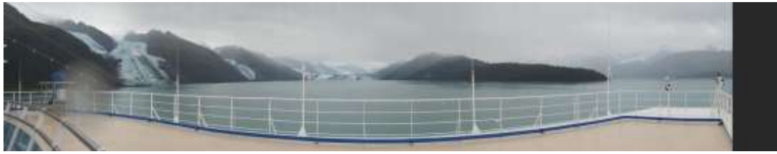
Panoramic view of College Fjord (west, left > east, right)