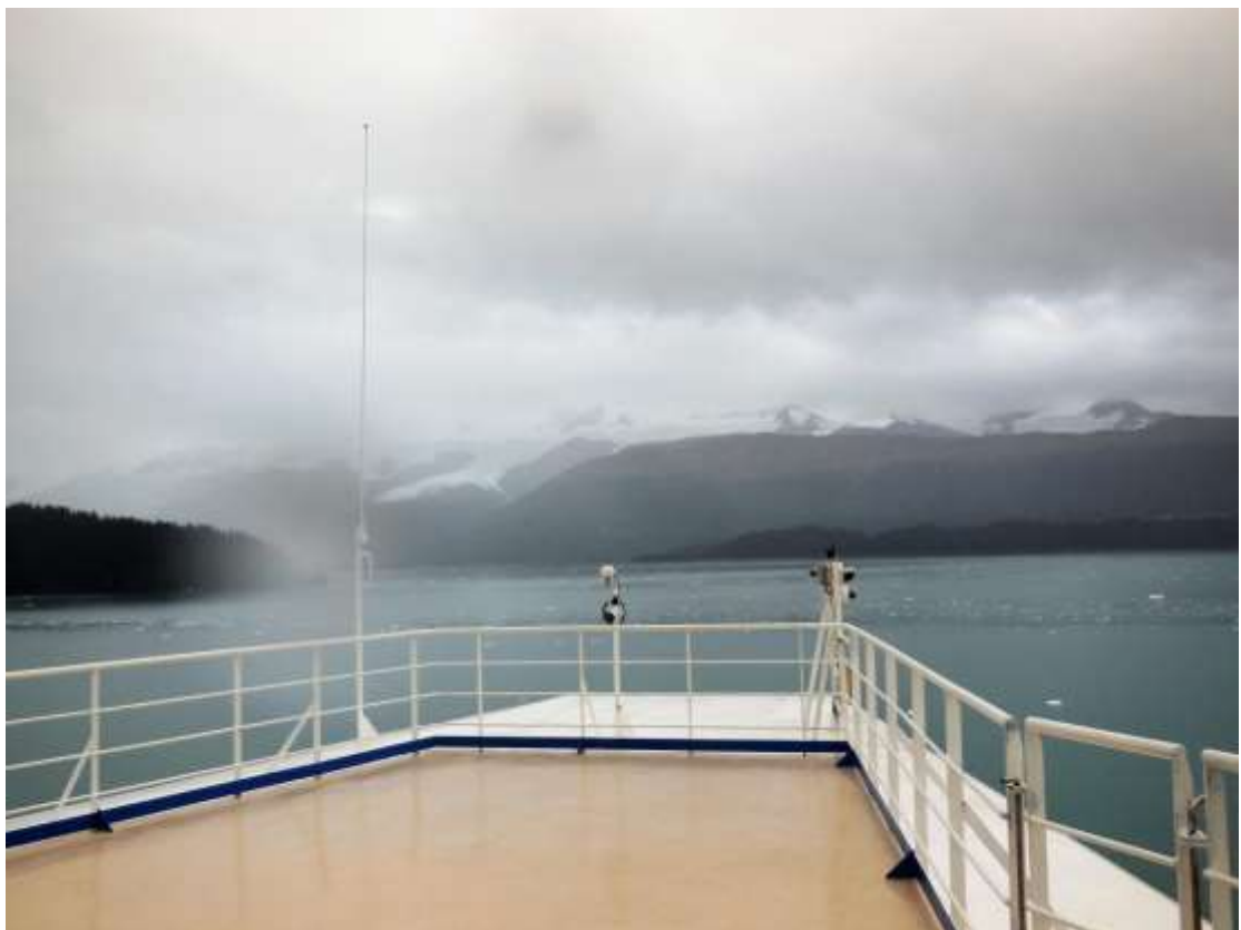
Glaciers above Yale Glacier (left inlet).