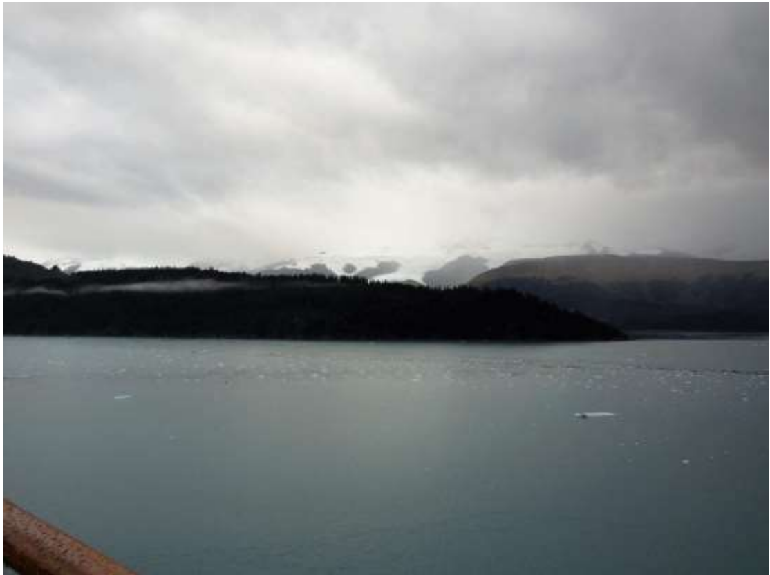
Leaving College Fjord.