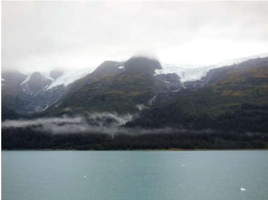
Valley glaciers (above) and tidewater glaciers (below).