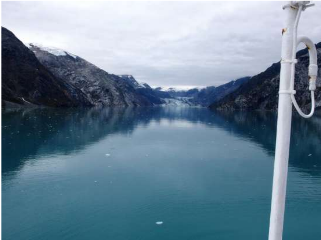
Leaving College Fjord. College Fjord is two miles wide.