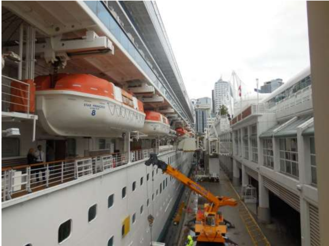
Watching the baggage being loaded onto the ship.