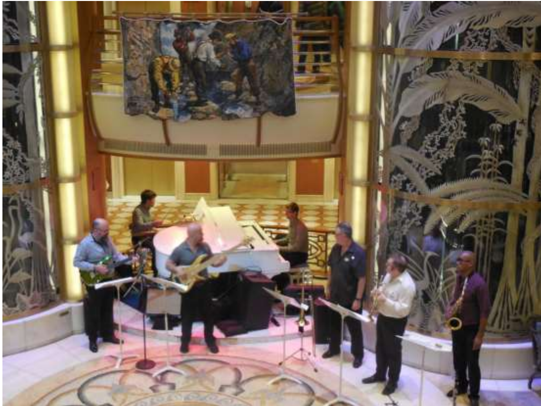
Entertainers in the Piazza area.