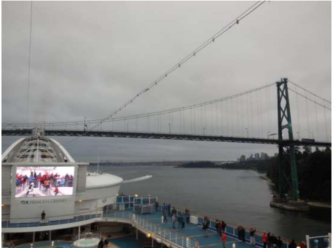
Sailing under the bridge on a cloudy, rainy day.