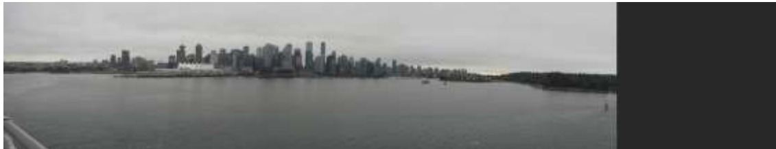
Panoramic view of the city of Vancouver as we sail away.