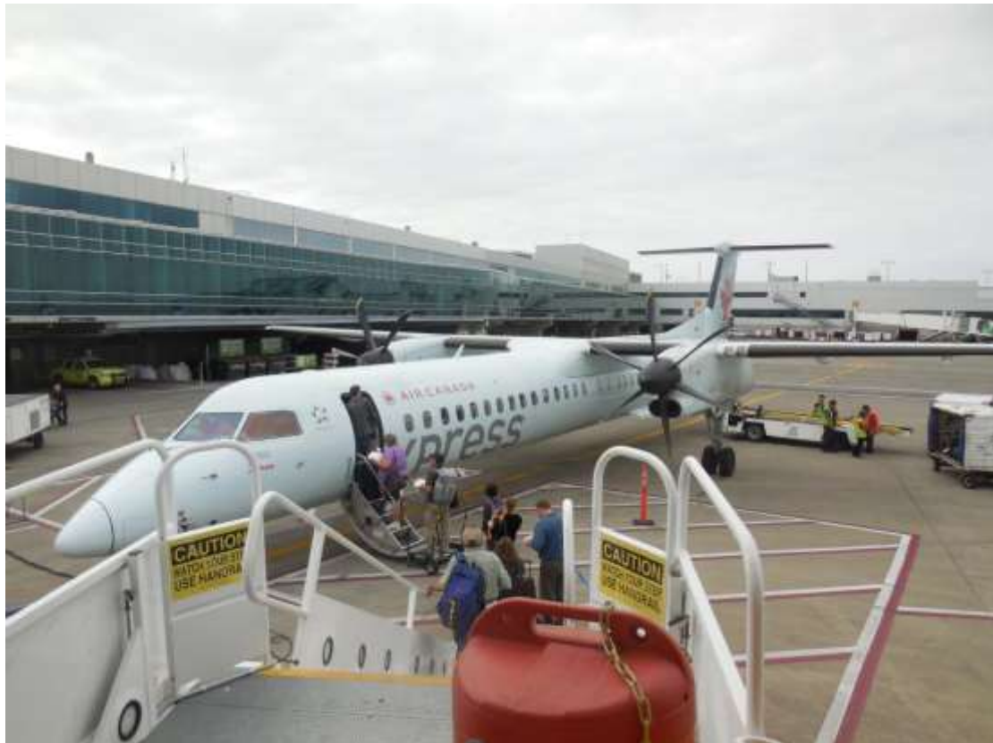
Taking off from PDX (Portland, Or) on Air Canada to Vancouver, B.C.