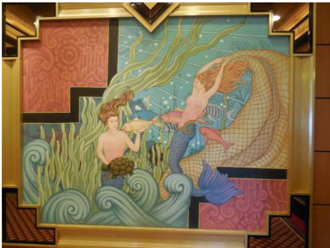
Another mural on the ship.