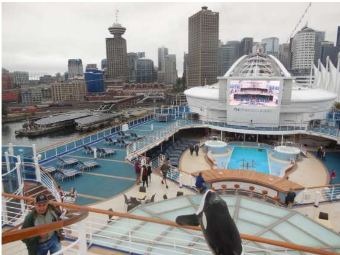
Exploring the cruise ship.