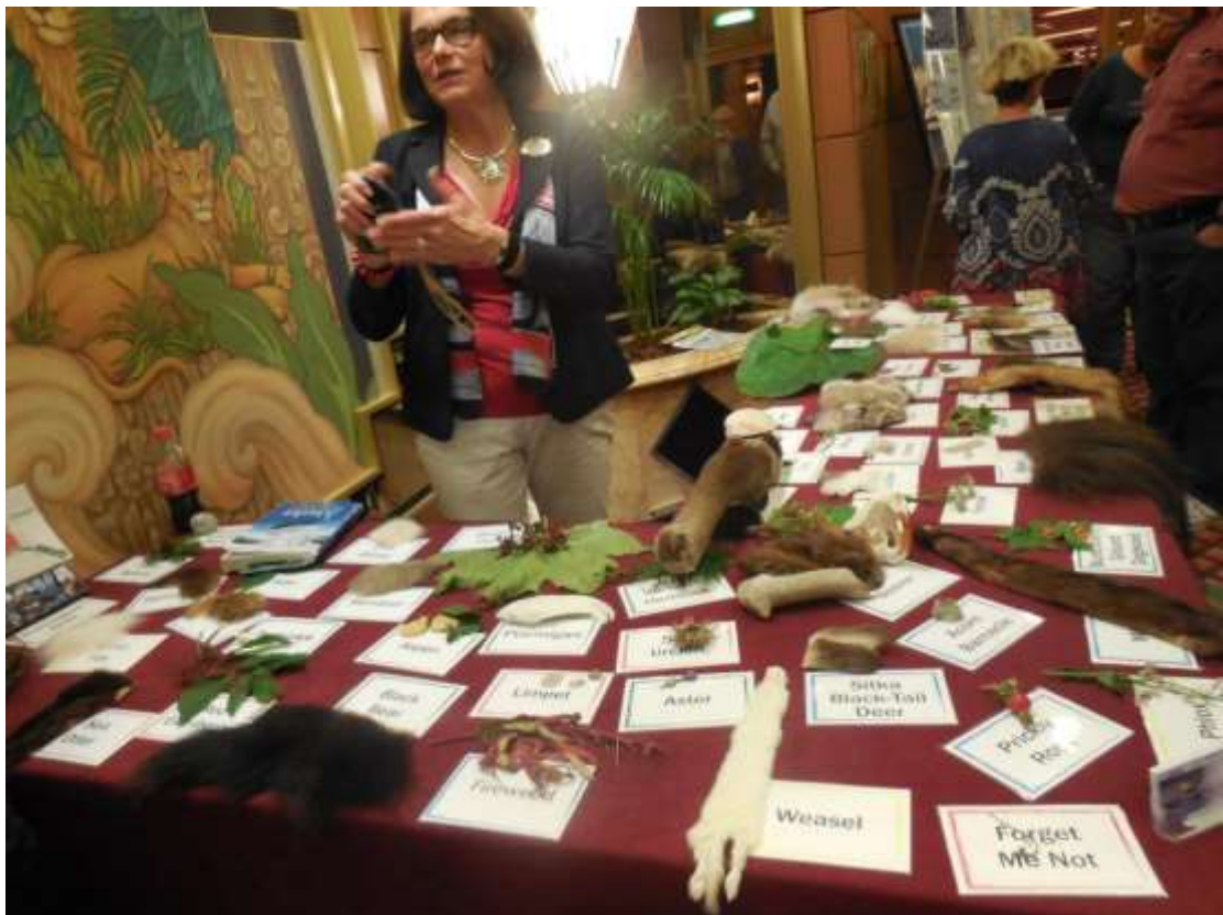
Display of items pertaining to Alaska flora and fauna.