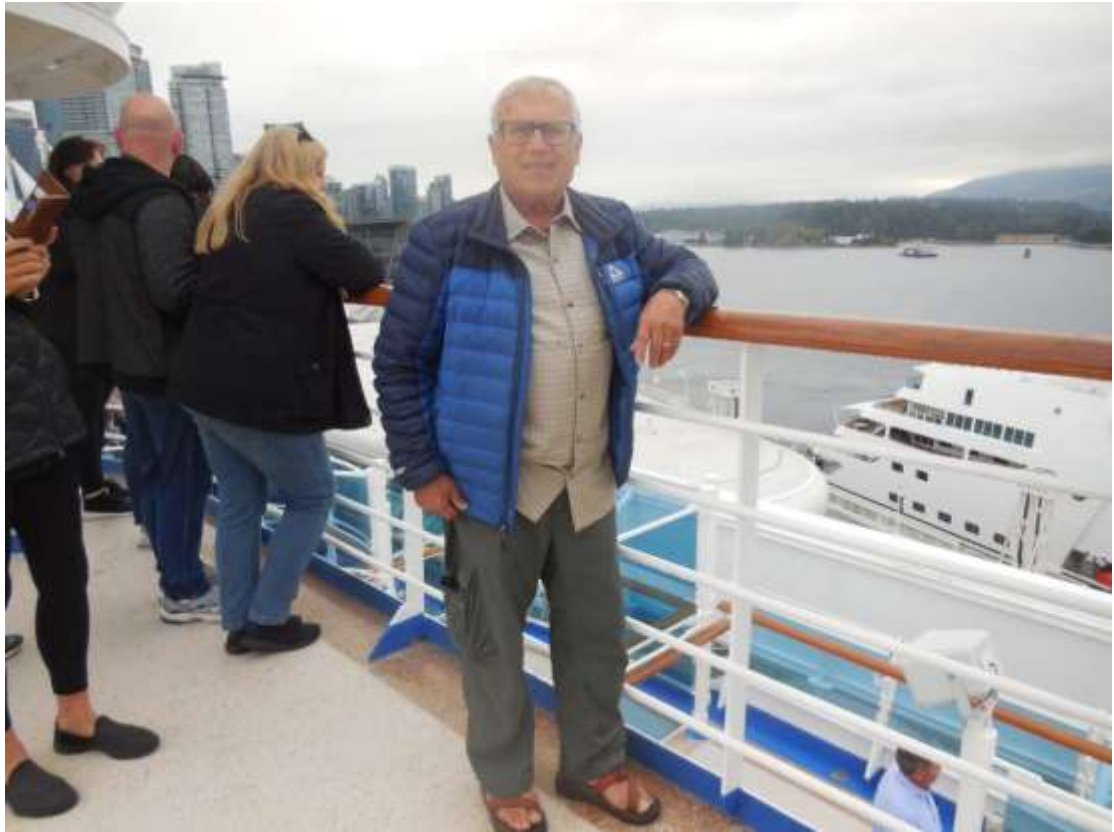
Getting ready to sail.