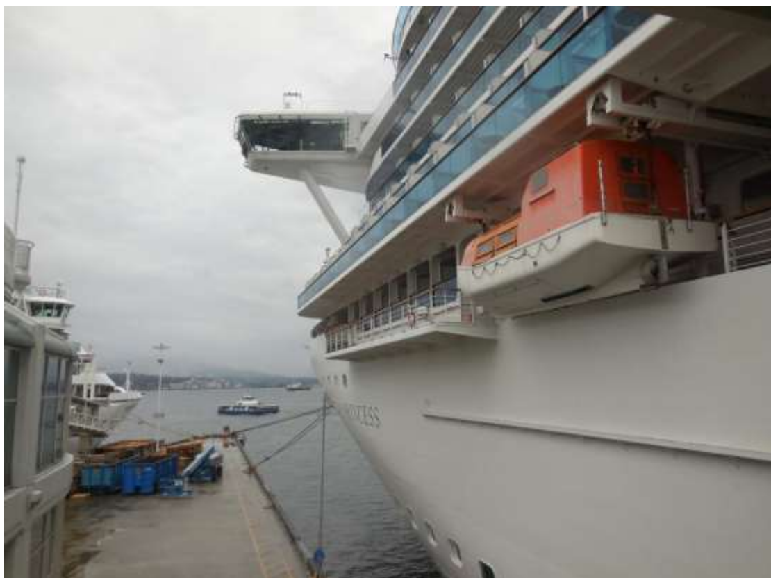
Boarding the Star Princess at Vancouver, B.C.