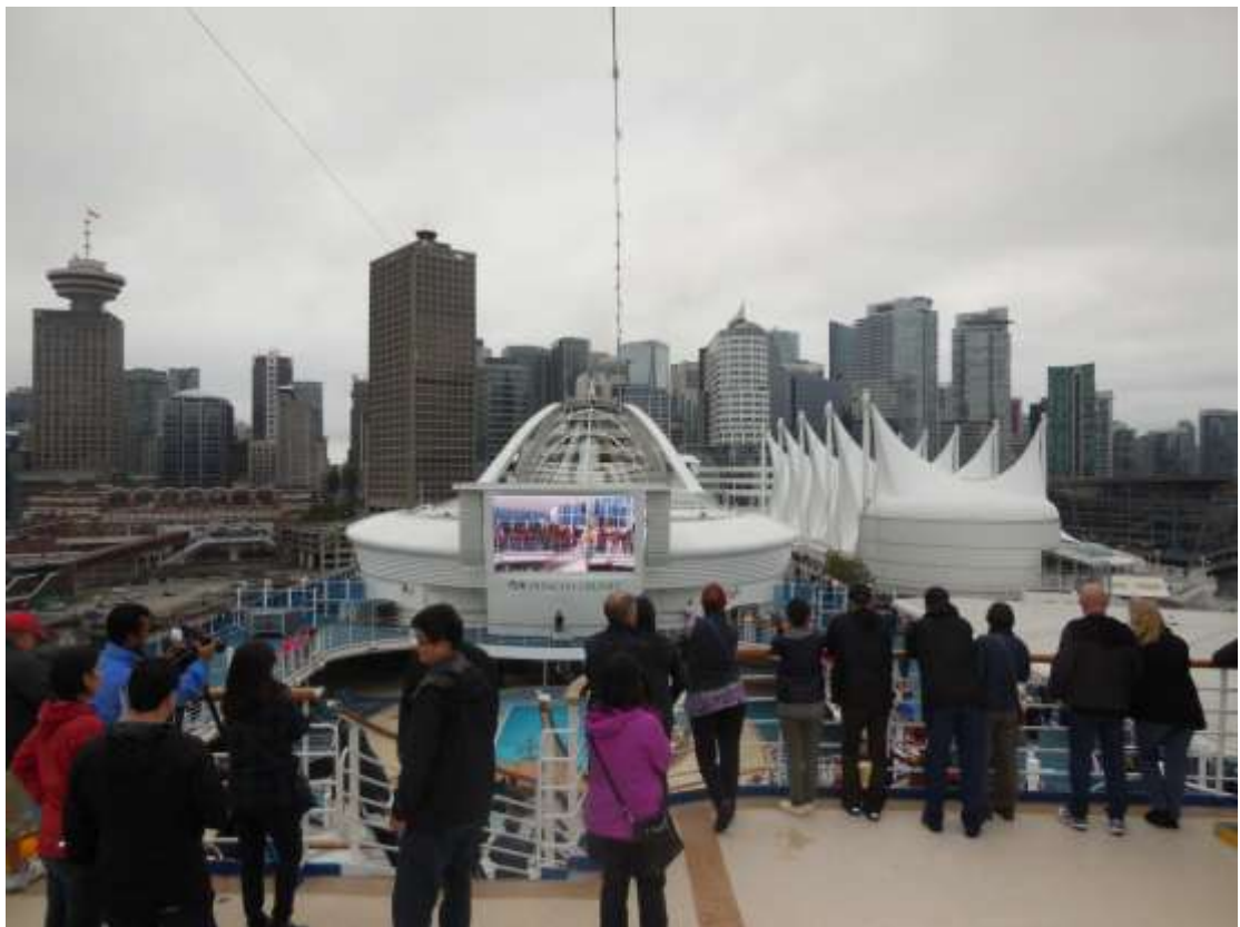
Leaving the port of Vancouver, B.C.