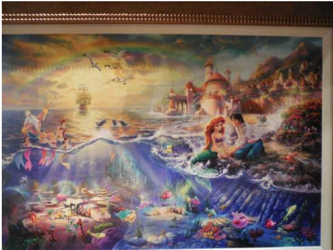
Little Mermaid painting on exhibit. Painting by Thomas Kinkadee.