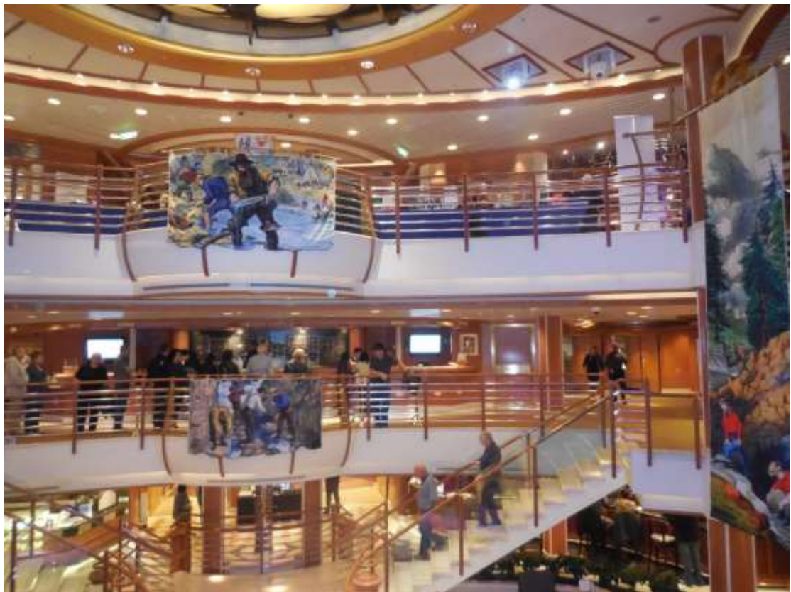
Exploring the Piazza (center) of the ship.