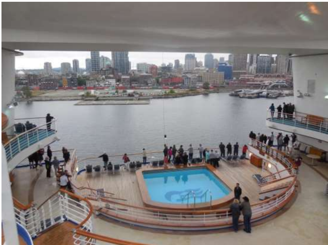
View from the back of the ship as we embark on our voyage.