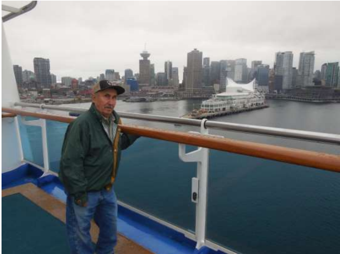
Full speed ahead.