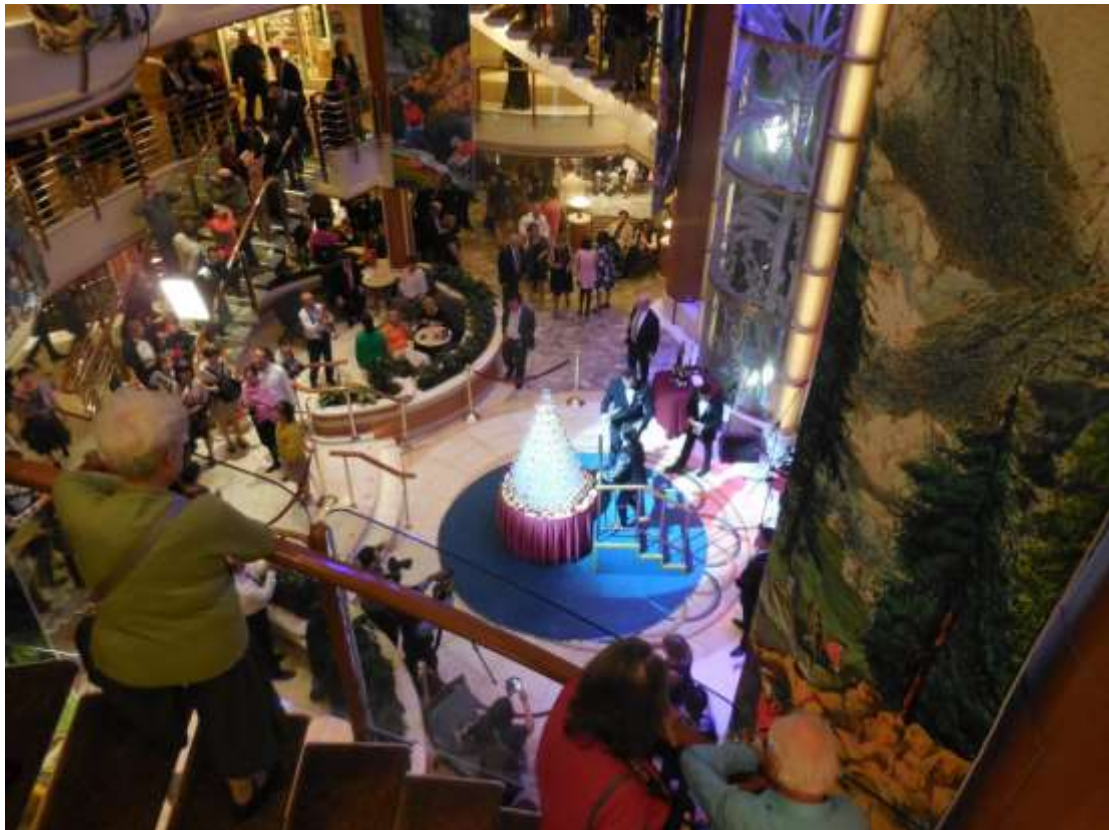
View of piazza area - champagne glass artistic structure.