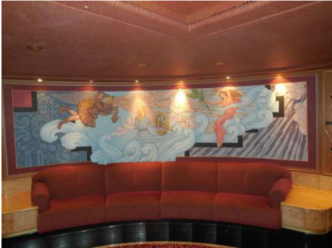
Mural on board ship.