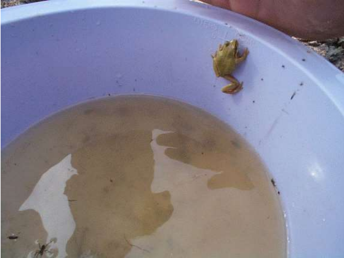
6. Aquatic Study: a captured tree frog tries to escape from the liter bowl.