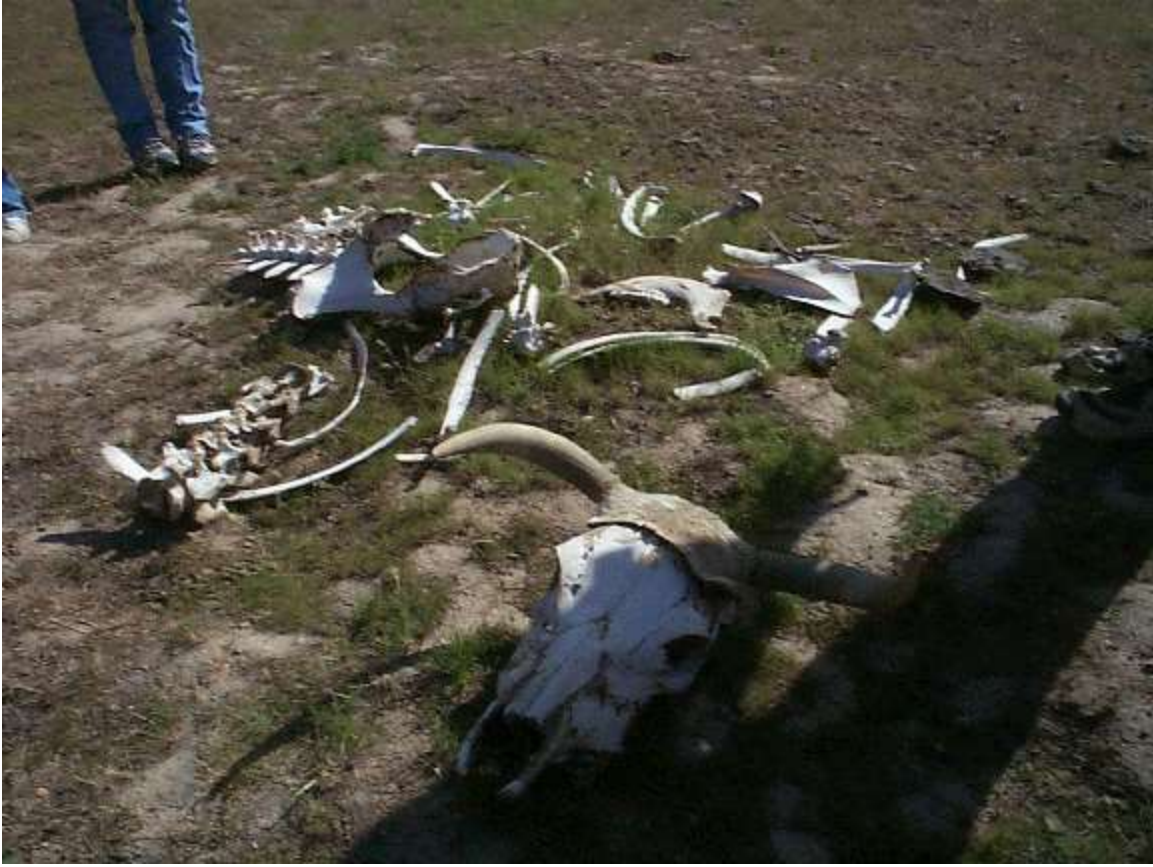
12. Bones of a cow found alongside a trail.