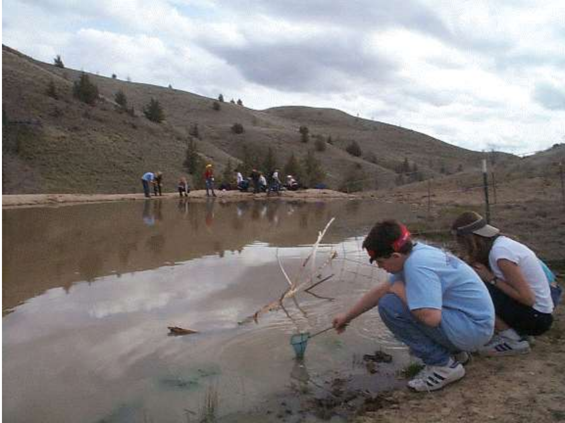
5. Aquatic Study: students capture invertebrates with small fish nets at the stock ponds.