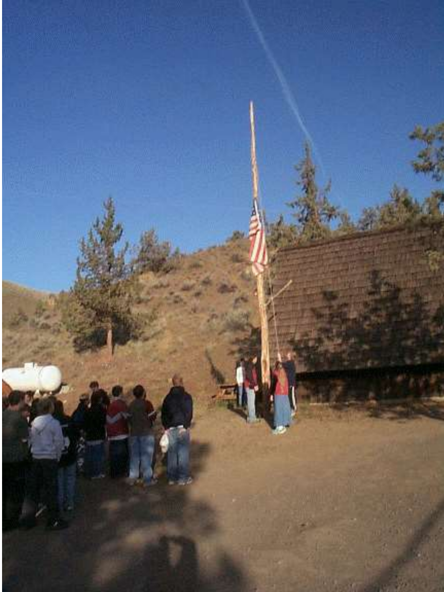
10. Taking down the flag as the evening shadows descend on the students first day at camp.