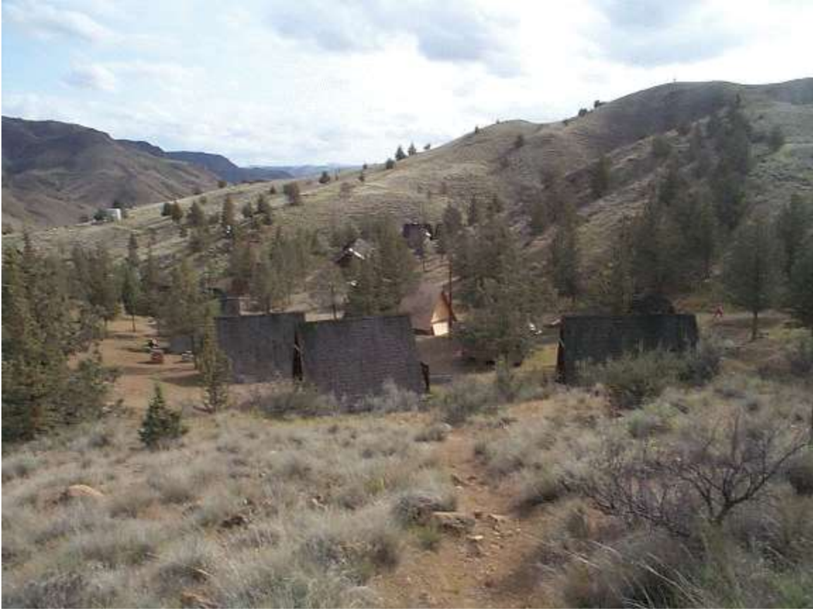
7. Back to Camp Hancock, western end of camp.