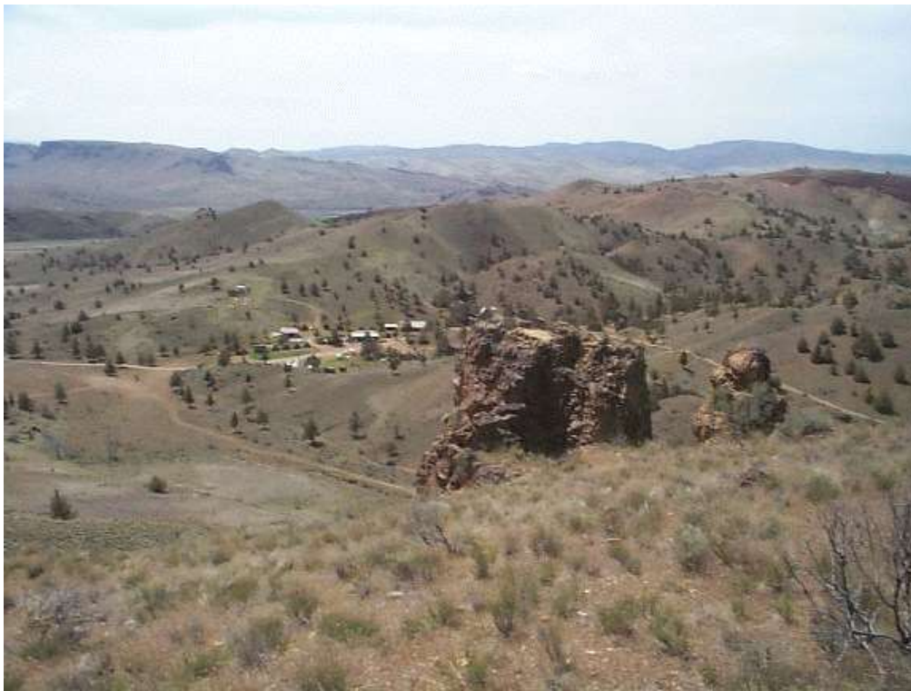
16. View of Camp Hancock for a hill (looking southward).