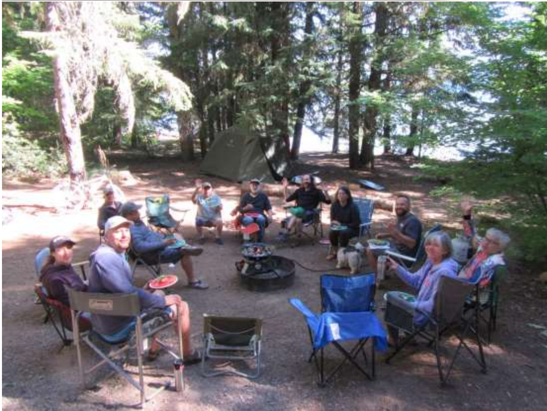
Sitting around the campfire and enjoying a meal.