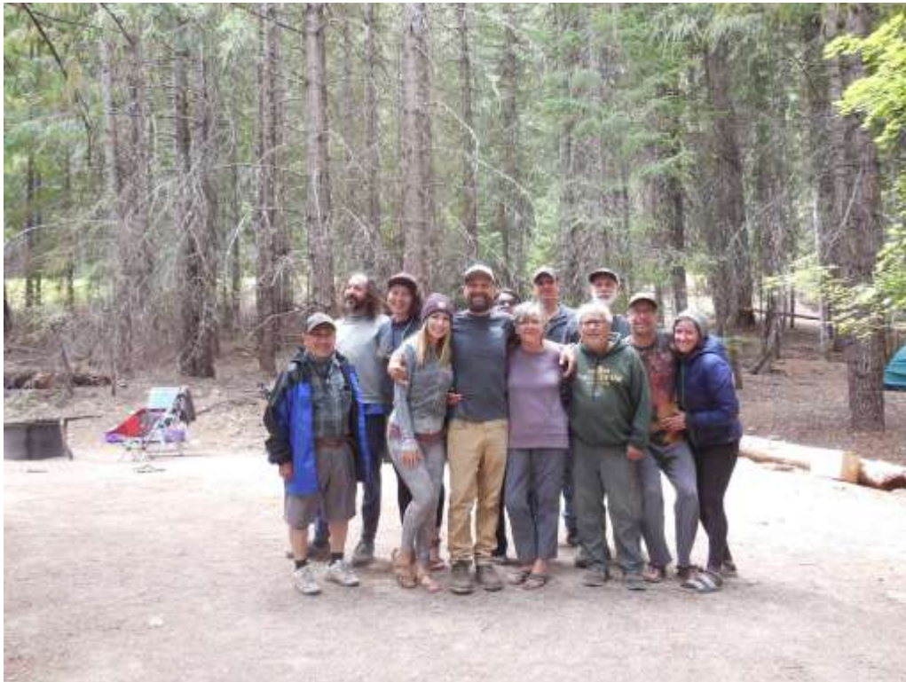
Farewell – group photo.