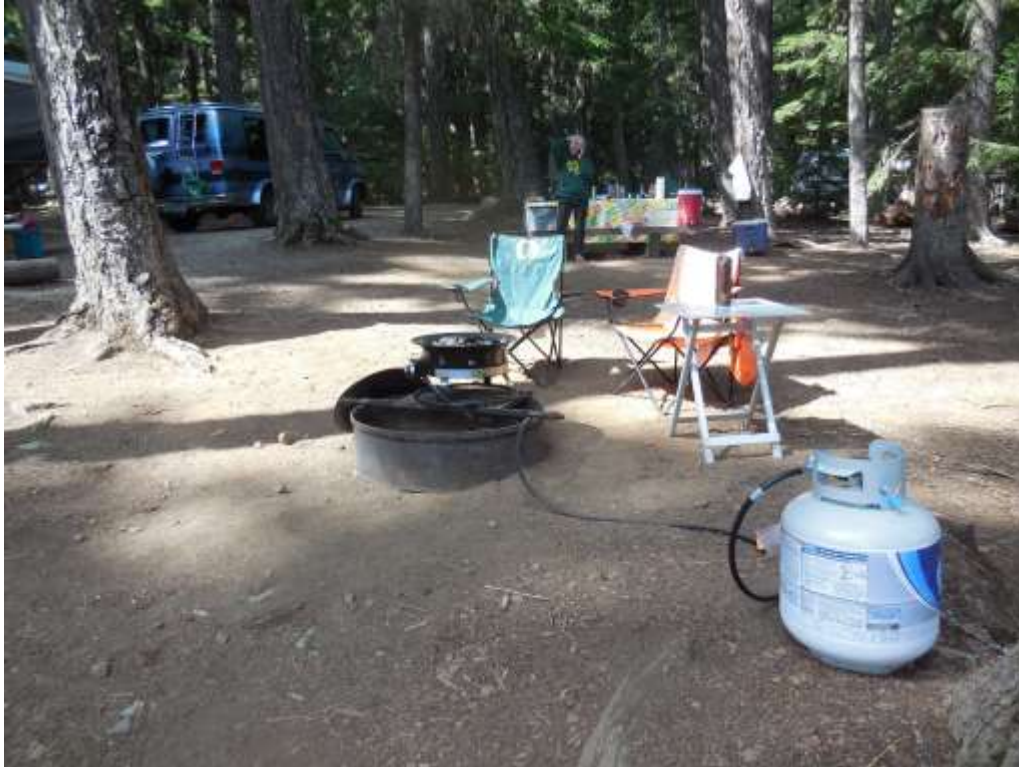
During the fire ban, we used a camp fire bowl with propane.