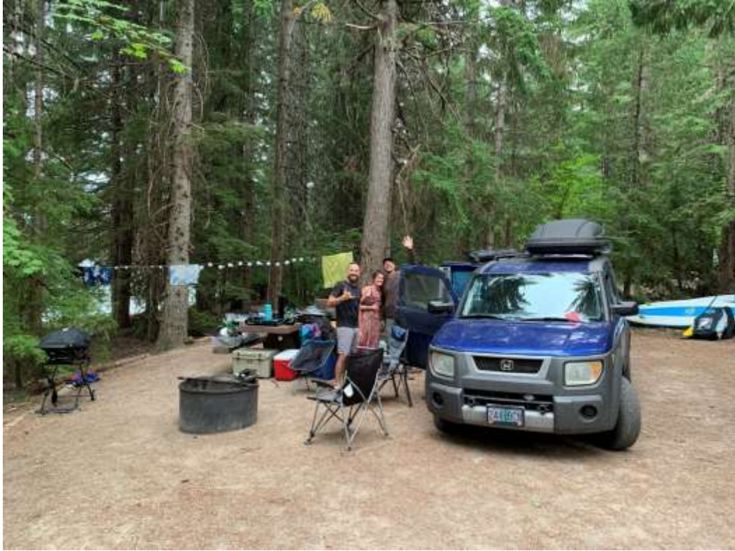
Yuri Prasoloff and Stacey Mairs bring their compact camper (also includes sleeping).