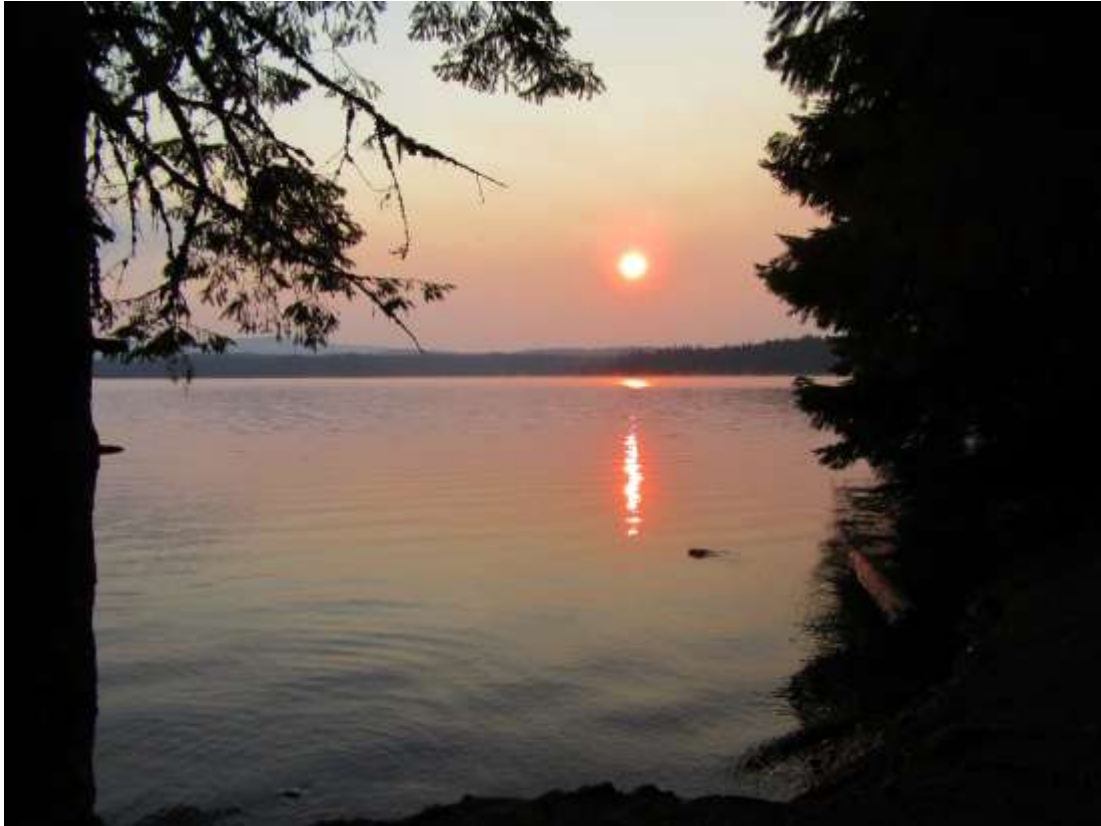
The red sun in the morning was due to the smoke from a nearby fire.