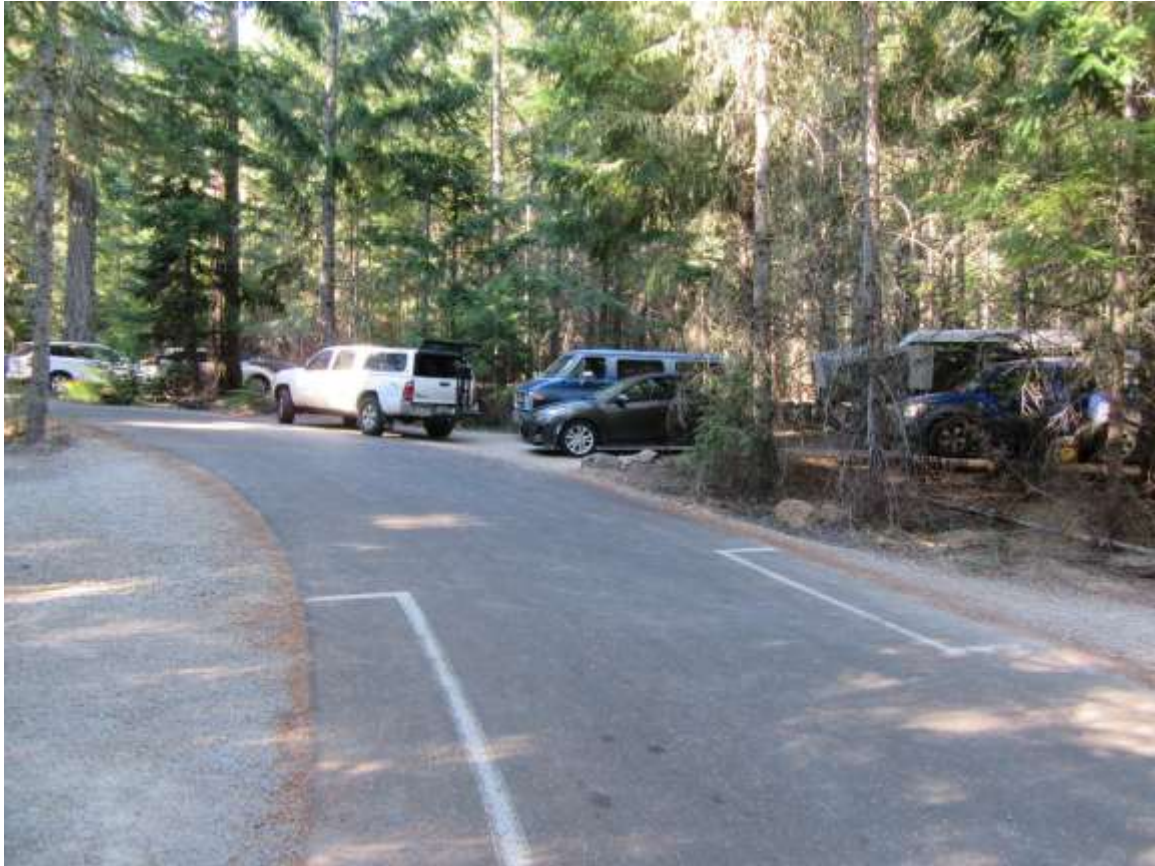
Hoodview campsite #41 was our headquarters.