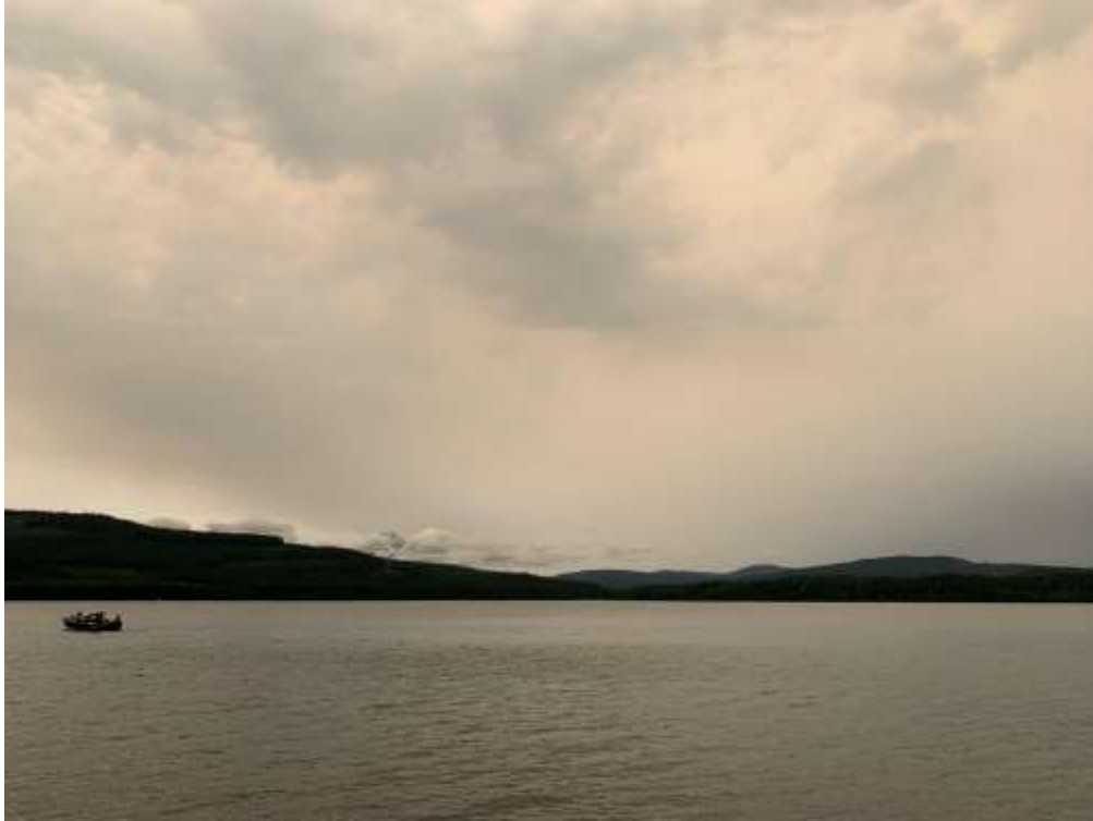
Smoky overcast from north arm of Timothy Lake fire.