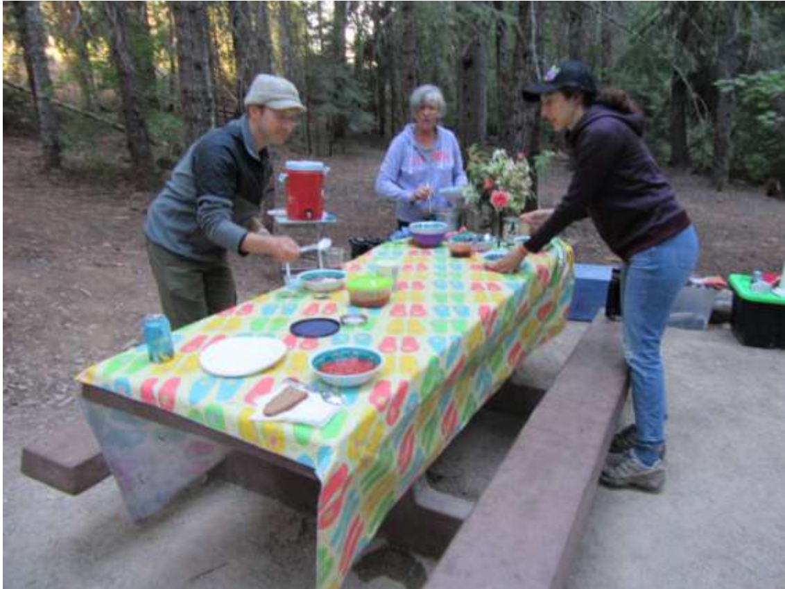
Setting the table for a borshch (Борщ) dinner.