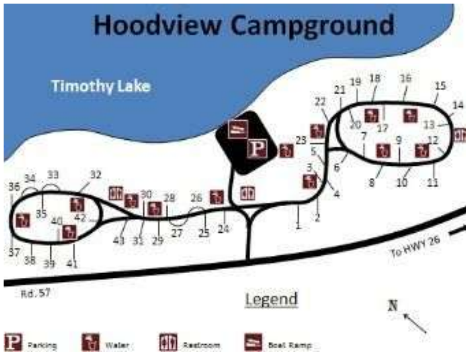
Old Site – 1976-2019