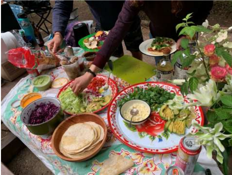
Rita and Jeff prepared quite a "spread" of healthy food.