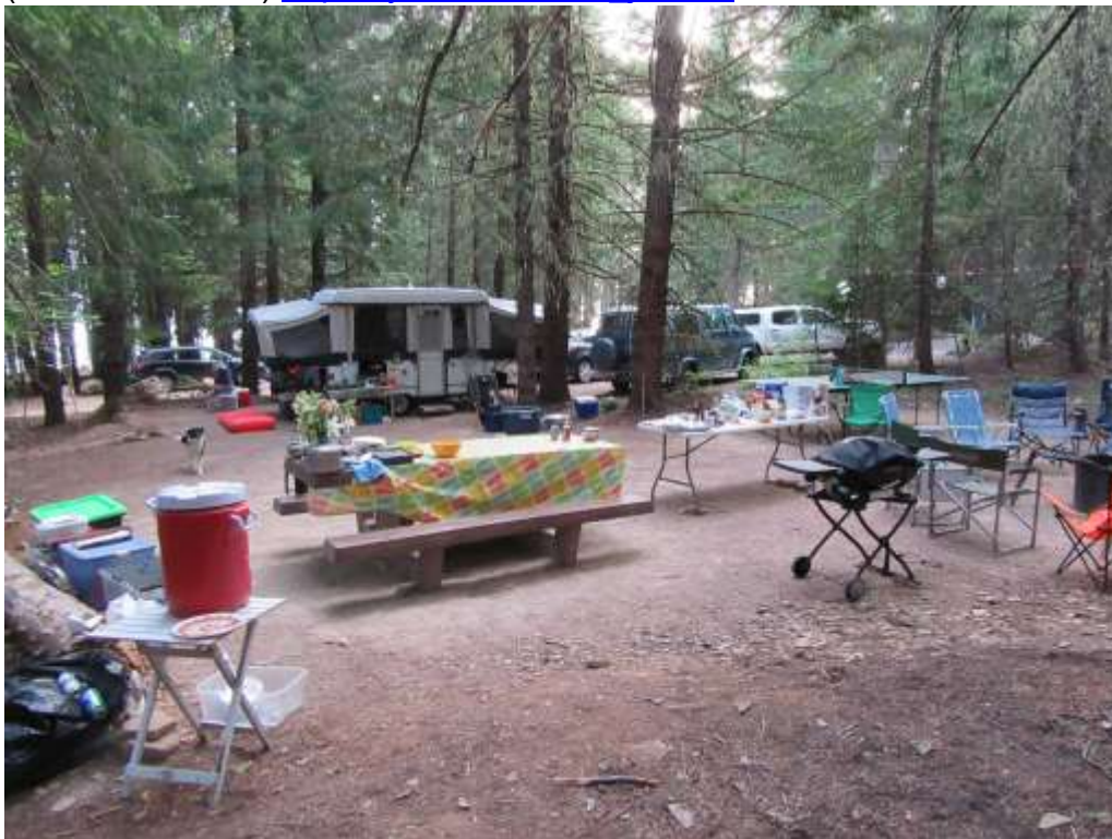
The morning after.