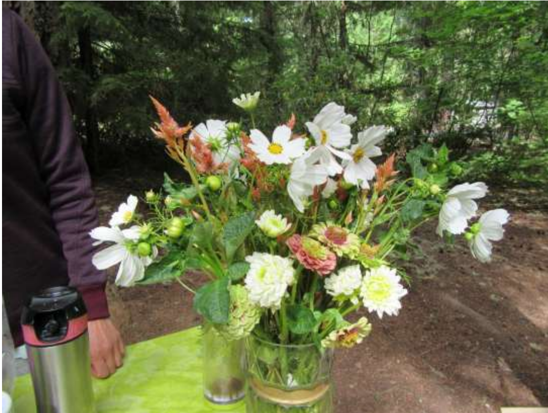
Masha brought a bouquet of flowers.