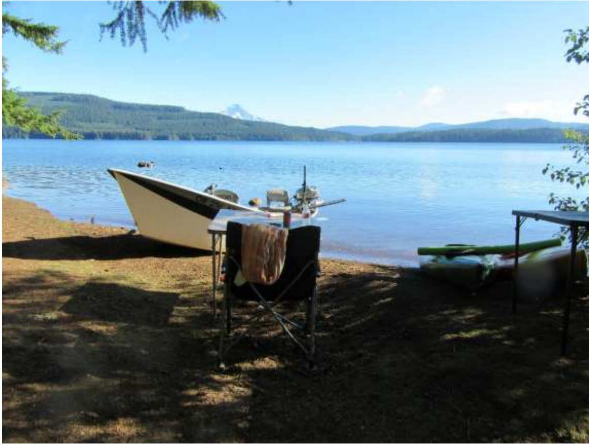
The smoke had cleared on the third day (Saturday), and we could see Mount Hood.