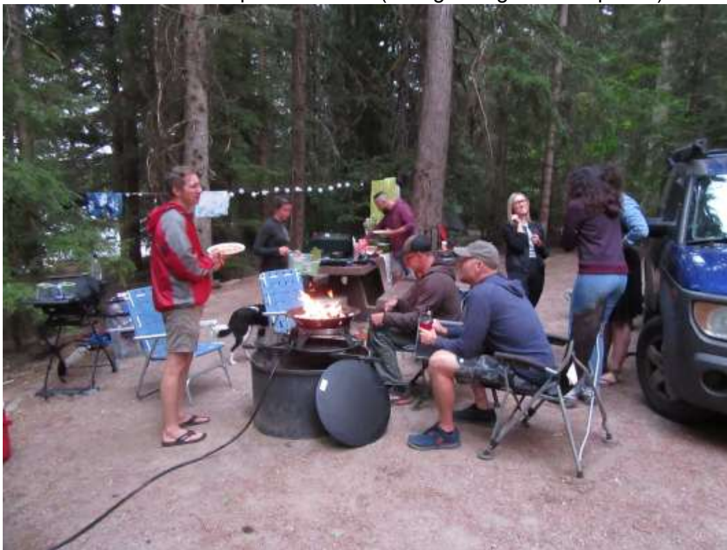
The new way to have a campfire is to buy a fire pit bowl, attached to a propane tank.