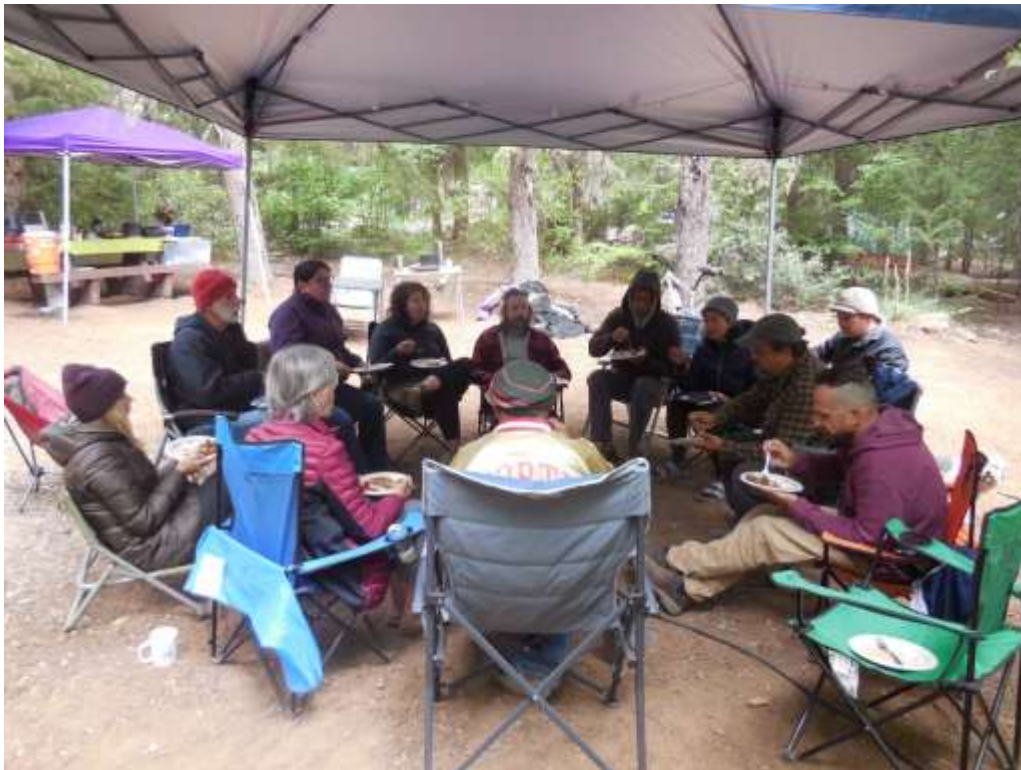
No one went hungry during the camping trip. We had plenty of great food, thanks to the "happy campers."