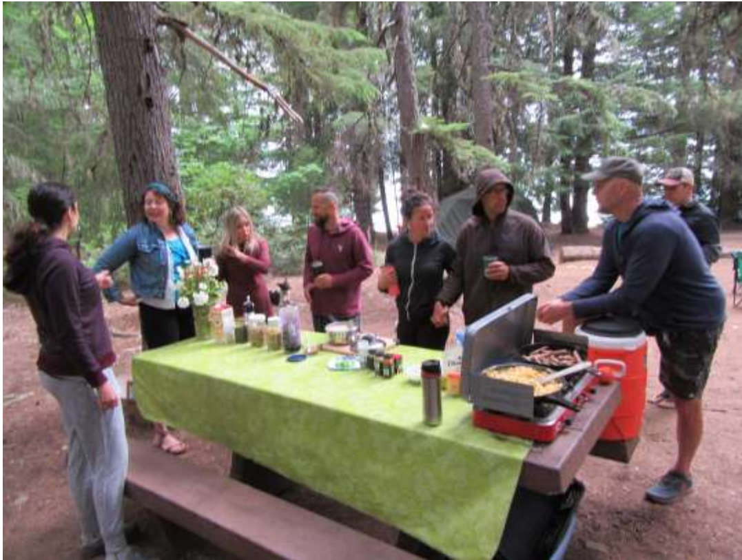
Cooking breakfast. Each meal was carefully orchestrated by the people who signed up for breakfast or dinner.