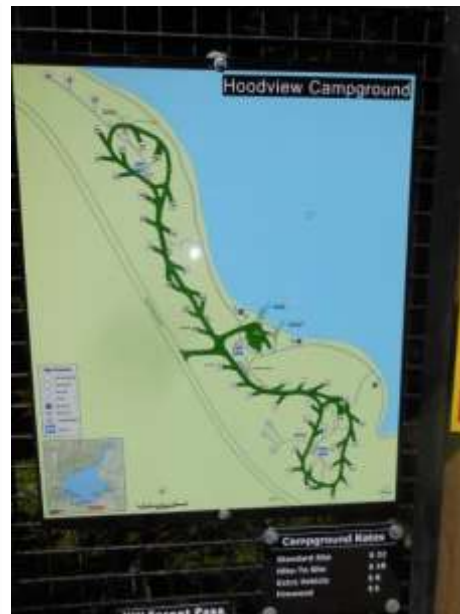
New configuration of Hoodview campground sites (2020).

NOTES Hoodview Campground ① July 19-22 (3 nights) (M-Th) Site #24 Paul-n-Elsa ② July 28-Aug. 1 (Wed-Sun) Wrick, Elsa+Paul arrive 30 th (Fri) Site #33? ③ Paul stays - Aug. 1-5 Site #33? ④ Aug. 5-8 (Wed-Sun) Friends Sites #33, 41, 42 Cathyn-Joe, Al+Maeha