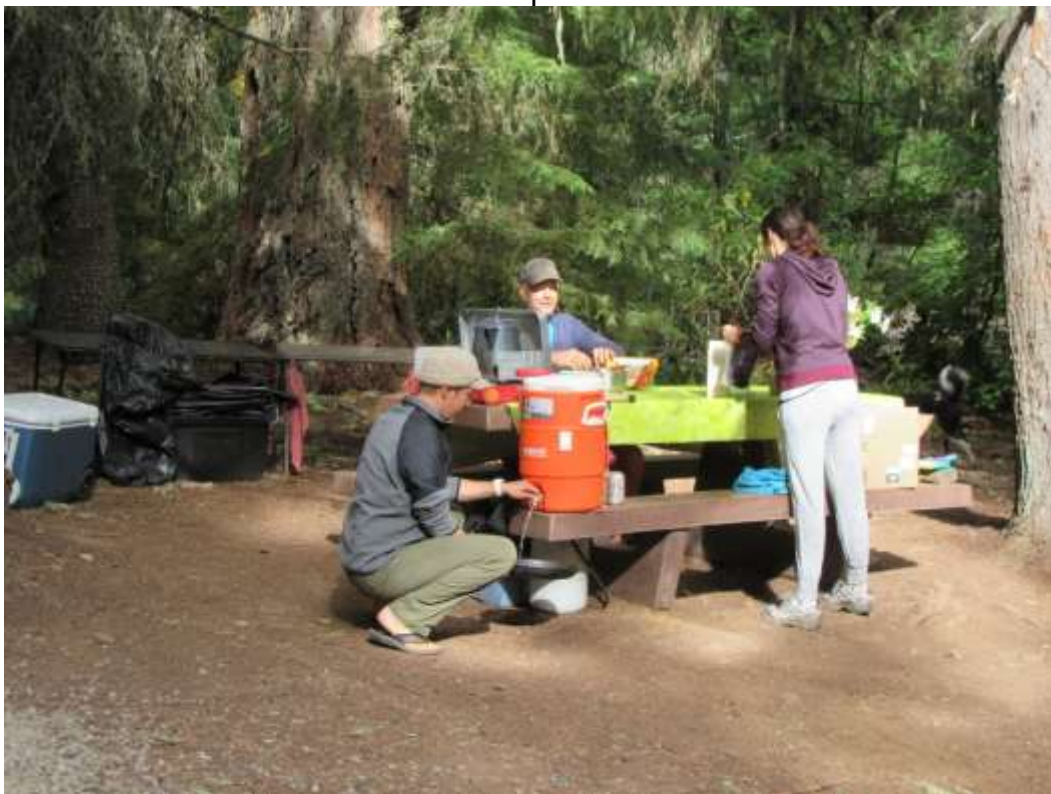
Rita and jeff start preparing breakfast.