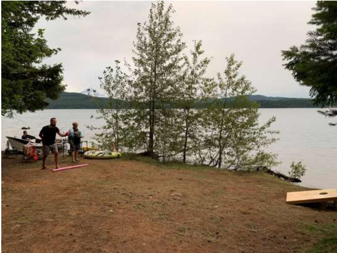
Al and I play a game of Corn Hole.