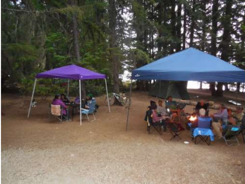
Saturday night (Aug. 7) was a little wet (with slight drizzle) and we had covering during our evening meal.