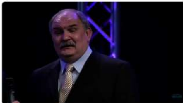
Як Олень - As A Deer (Вечір Носталгії)

https://www.youtube.com/watch?v=pqbaORjFsyk