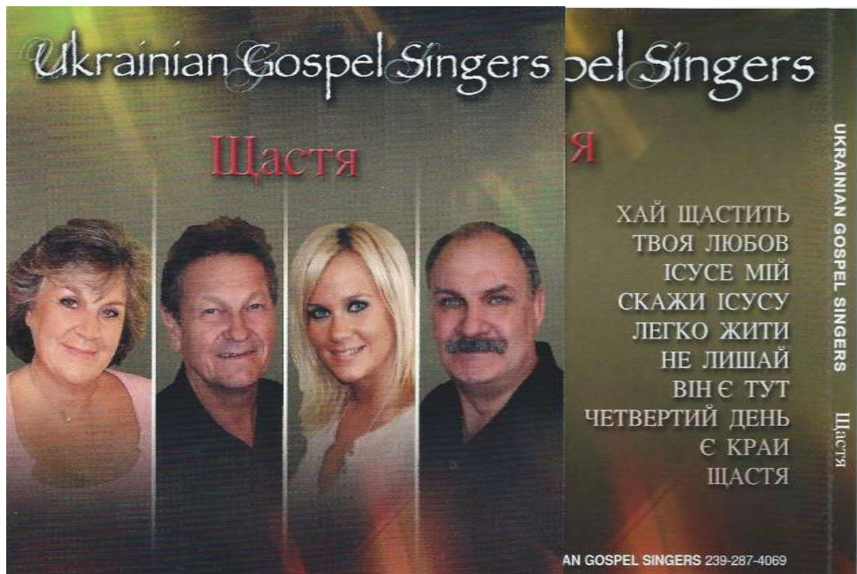
Ukrainian Gospel Singers - Album 4

https://wigowsky.com/songs/PeteK/PeteAlbum4.jpg