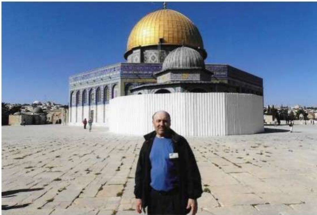
Temple Mount, Jerusalem

http://wigowsky.com/travels/israel/tour/pilgrimage.htm