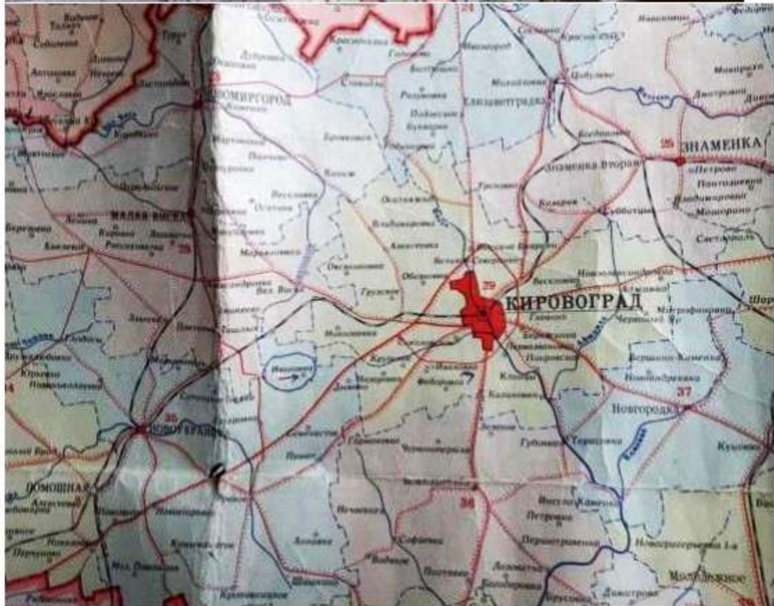
Ivanovka (is circled) – between Новоукраинка (left) + Кировоград (right)