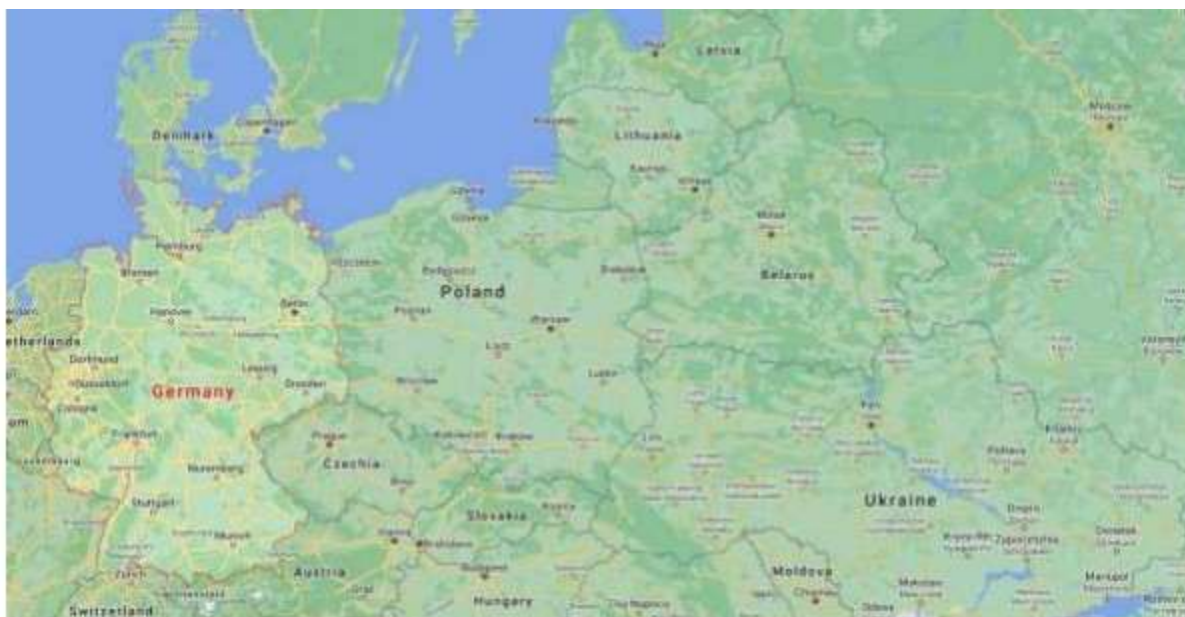
Travel from Ukraine through Poland to Germany (1943).