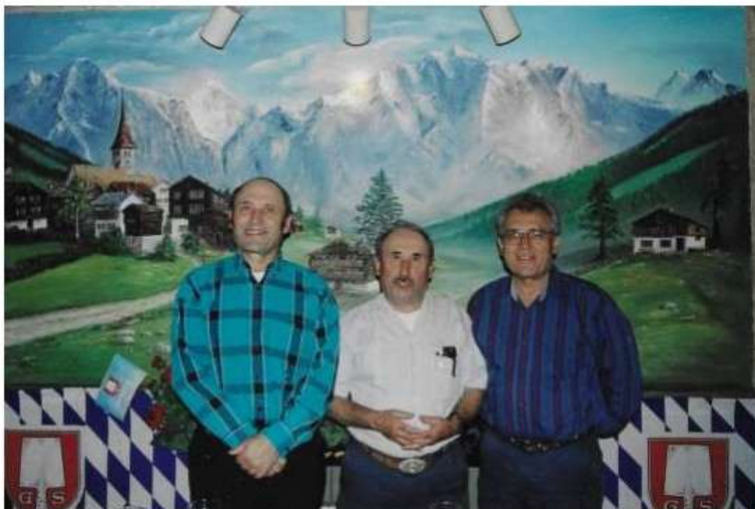
Three brothers with a German mother in a German restaurant