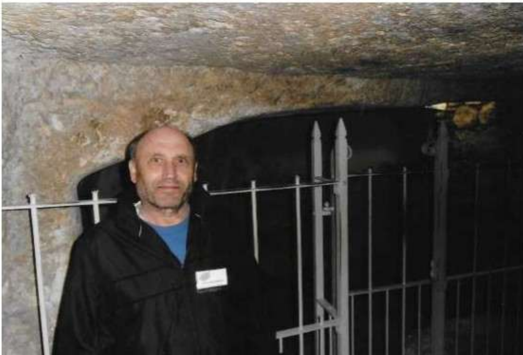
Inside the "Tomb".