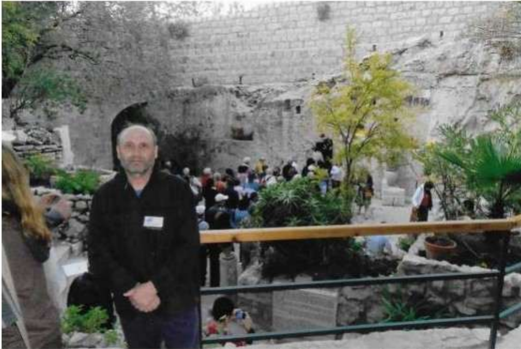
Garden Tomb, where supposedly the body of Jesus was buried (outside Old Jerusalem)